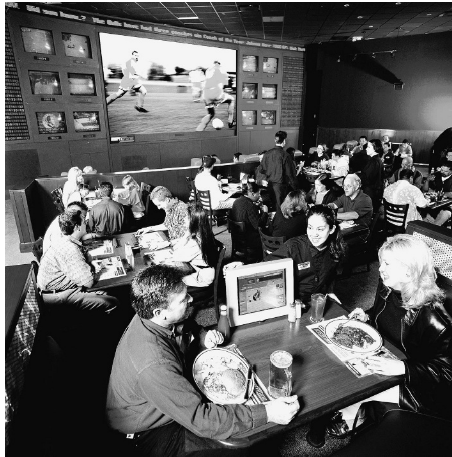
FIGURE 1.5 Some sports bars offer full-service dining but the focus is on cheering on your favorite teams, not necessarily on food and drink. Disney Regional Entertainment.

A special variation of the food-beverage combination is the wine bar , which first appeared during the 1970s as Americans discovered and learned to appreciate wines. Here the customer can choose from a selection of wines by the glass or by the bottle, beginning with inexpensive house wines and going up in quality and price as far as the entrepreneur cares to go. Some wine bars offer inexpensive one-ounce tastes (or groups of these one-ounce samples, known as wine flights ) to enable guests to sample a number of wines. A full menu, or fruit and cheese platters and upscale hors d'oeuvres, can be served.