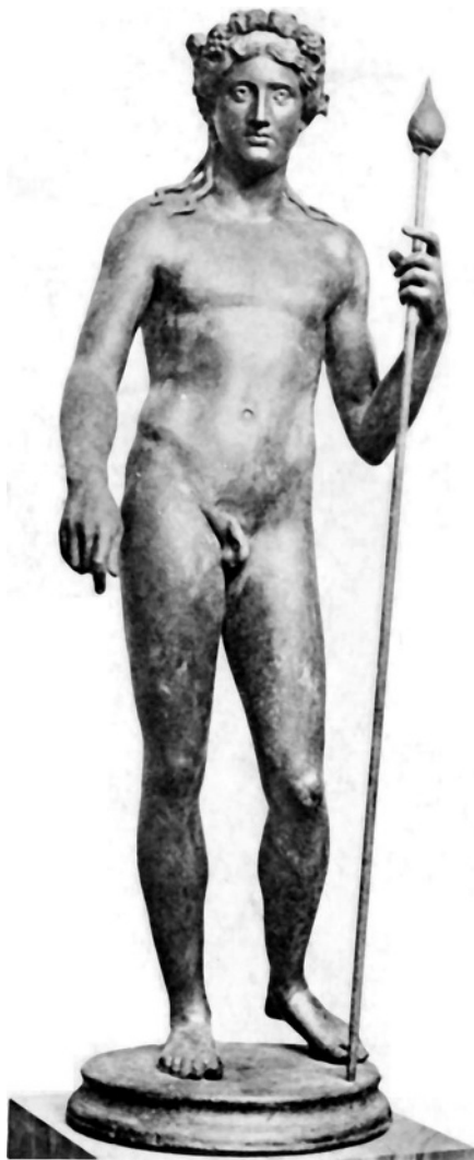
FIGURE 1.1 Bacchus, the Roman god of wine.

cessfully) to grow his own grapes at Monticello. By the early 1900s about 1,700 wineries dotted the United States, and they were mostly small, family-owned businesses.