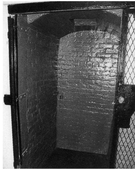
FIGURE 1.4 The trick door of New York’s ‘21’ Club, opened by pushing a metal bar into a tiny hole. Today the door still works and the area behind it is used as a wine cellar.

(Information adapted from a New York Times article, December 6, 2003.)