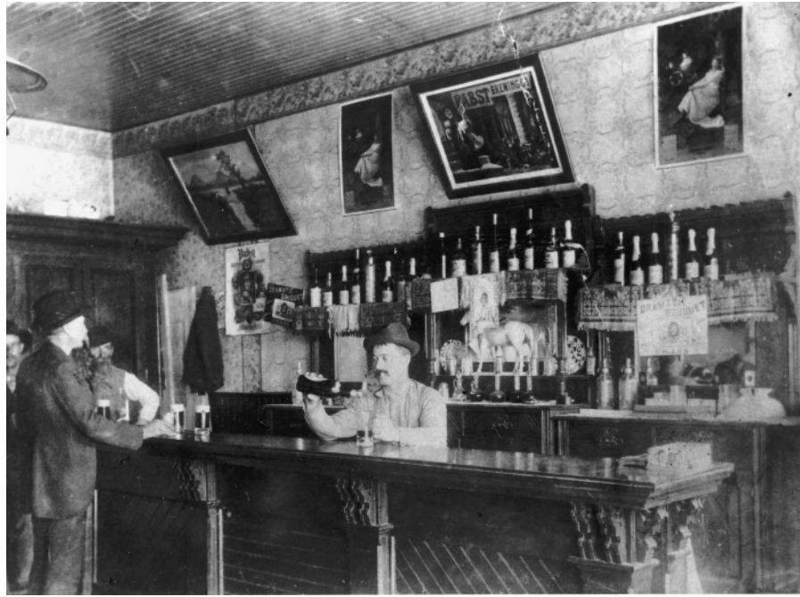
FIGURE 1.2 The typical bar setup today doesn't look much different than it did in the 1880s, when this photo was taken in Pocatello, Idaho. Courtesy of the Idaho Historical State Society, Boise, Idaho, photograph number 70-47.1.

The fervor was fed by the proliferation of saloons opened by competing breweries to push their products, many of them financed by money from abroad. By the late 1800s there was a swinging-door saloon (also called a joint ) on every corner in small towns and big cities. These establishments often became unsavory places because there were far too many of them to survive on sales of beer and whiskey alone, so many became places of prostitution, gambling, and other illegal goings-on.