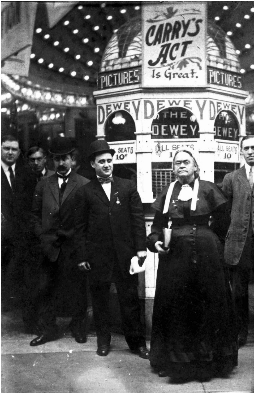
FIGURE 1.3 Anti-alcohol activist Carry Nation took her "show on the road" in the early 1900s, destroying Kansas barrooms with hatchets and baseball bats as "The Barroom Smasher."