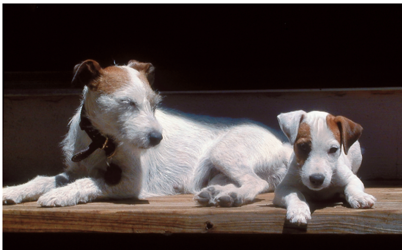
A JRT's coat provides protection against thorns and burrs as well as dampness.

The tail “should be set rather high, carried gaily and in proportion to body length, usually about four inches long, providing a good hand-hold.” The tail is cropped at about three days old so it does not break while backing out of earth, and the dewclaws are removed. The tail is sometimes used as a handle of sorts to extricate the dog from the earth. It usually requires holding the dog's tail and hind legs to dislodge him from work below ground.