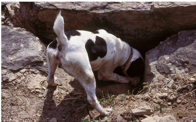
The Jack Russell Terrier is first and foremost a hunting dog, developed to hunt quarry underground.

The breed was not meant to harm the quarry he encounters. Still, JRTs do have different styles of work. Some are "hard" and engage their quarry with intent to inflict harm, while some are "soft" and bay at or dislodge their quarry with their intense presence. All JRTs, however, should have the attitude, grit, and tenacity to confront larger and more formidable animals below ground. A very intelligent and cooperative Jack Russell may sometimes be called out of the den by the handler, but don't count on it!