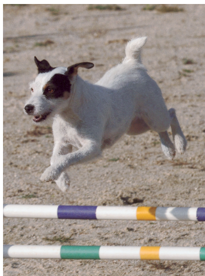
Effortless movement and great athleticism are hallmarks of the breed.

The feet of the Jack Russell Terrier need to be "round, hard padded, of cat-like appearance, neither turning in or out." The dog needs strong feet for digging and crossing varied terrain.