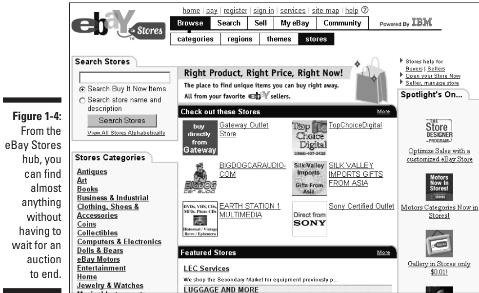
Figure 1-4: From the eBay Stores hub, you can find almost anything without having to wait for an auction to end.