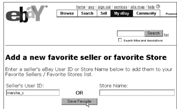
• Figure 1-11: Adding a new favorite seller.

You can save up to 30 sellers or stores on this page.