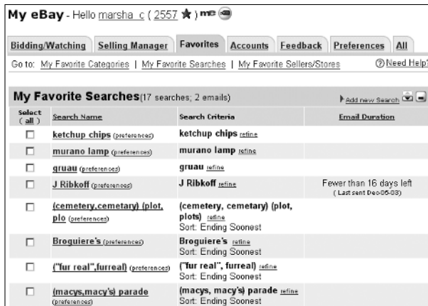
• Figure 1-10: My eBay Favorite Searches.

Figure 1-10 shows you my personal My eBay Favorites tab. (No laughing when you see the favorite searches — if you ever meet me, just ask me about them.) This tab is where your favorite search shows up after you've recorded one. You can also record a search from this page by clicking the Add New Search link in the top bar.