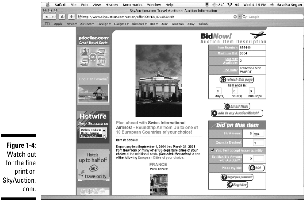
Figure 1-4: Watch out for the fine print on SkyAuction. com.

As another example, SkyAuction was selling a ticket on Iberia Airlines to Europe, and the winner bid $400. But the fine print shows he'd be charged an extra $50 if he wanted to depart or return on a weekend, an extra $119 for taxes, and an extra $65 to $165 if he wanted to fly from any city other than New York. That means his $400 ticket could cost more than $700 — which isn't much of a deal!