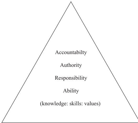
Figure 1.1 Preconditions to accountability (from Bergman 1981).

The Code commits each individual nurse, midwife and health visitor to safeguard and promote the interests of both society and individual patients. It also requires that each shall act in such a way that justifies the trust and confidence of the public, and uphold and enhance the good reputation of the professions. In order for the nurse to fulfil these requirements, emphasis is placed on four main areas: knowledge, skill, responsibility and accountability; these were the basis of the principles of the Scope of Professional Practice (United Kingdom Central Council for Nursing, Midwifery and Health Visiting (UKCC) 1992).