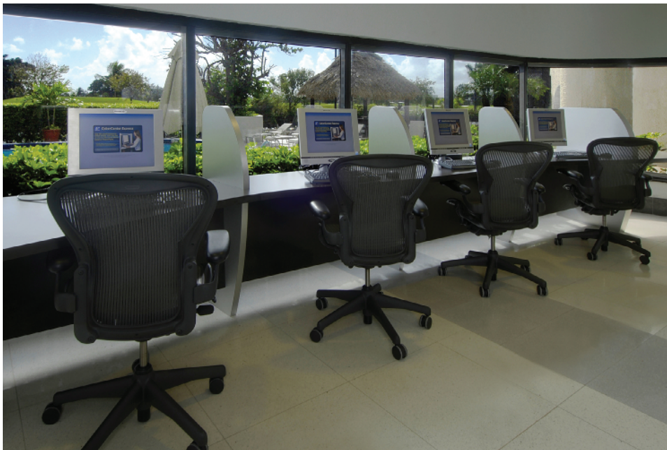
Hotels now provide Internet stations to their customers.

When a firm customizes the experience for each individual consumer.