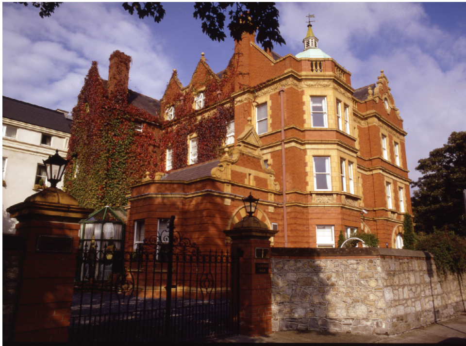
Hotels such as the Wingate Tulfarris Hotel and Golf Resort in County Wicklow, Ireland, offer a range of room rates and amenities for guests with differing levels of purchase power.

Environmental scanning can be a formal mechanism within a firm, or merely the result of salespeople and managers consciously monitoring changes in the environment.