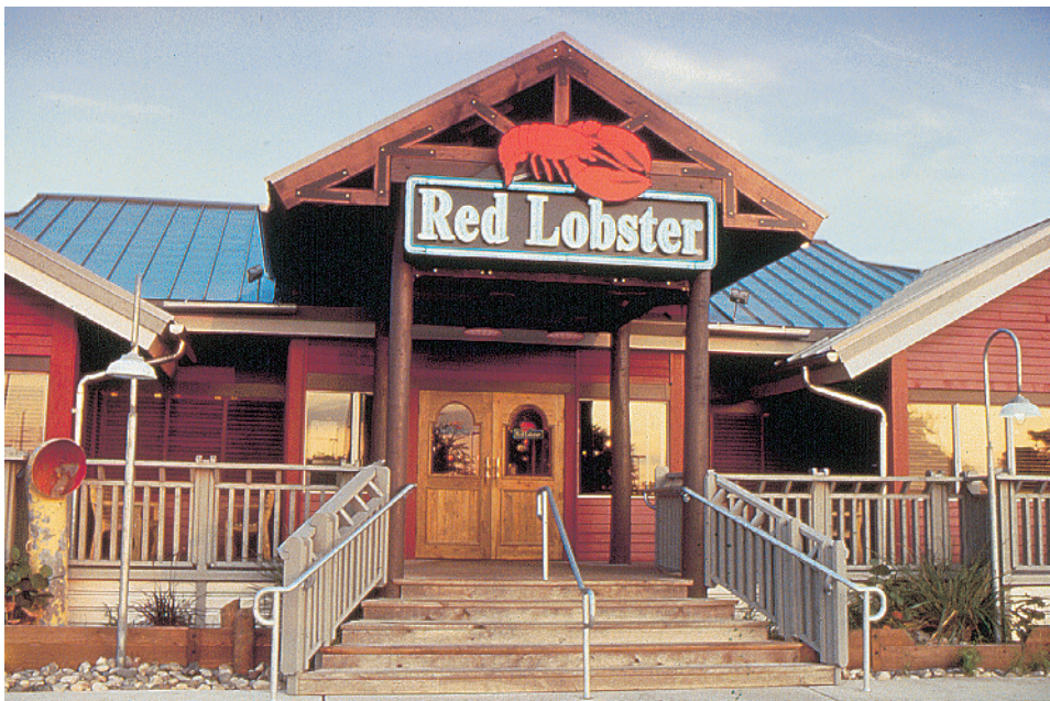
Hospitality firms use the elements of the marketing mix to establish a competitive position in the market.

The basic elements include advertising, personal selling, sales promotion, and public relations. All of the elements are equally important.