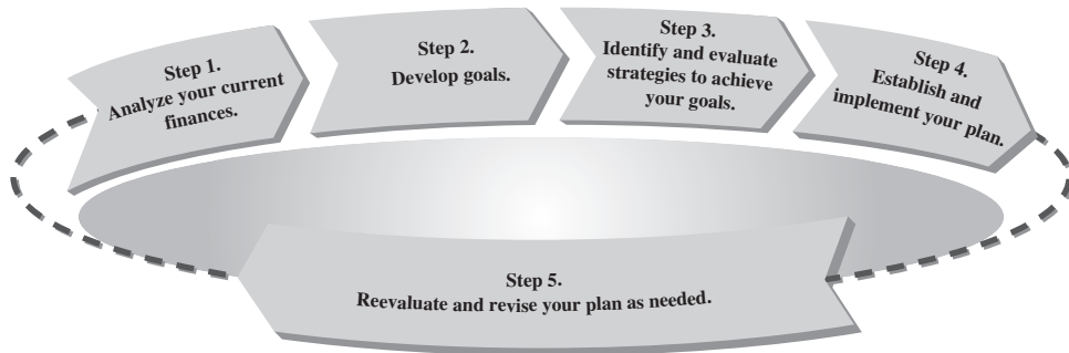
The five-step financial planning process.

relationships with friends, family members, and coworkers. As many couples know, financial difficulties are a major contributor to marital problems. Most people also find that the self-sufficiency that eventually results from good financial planning improves their self-esteem.