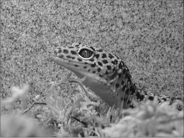
Figure 1-2: Gecko eyes are amazing; much like cats' eyes.

leopard geckos (and other nocturnal geckos) are able to see color — or how much color they can see — it is obvious from their behavior that nocturnal geckos do see movements, outlines and shapes even in very low light situations.