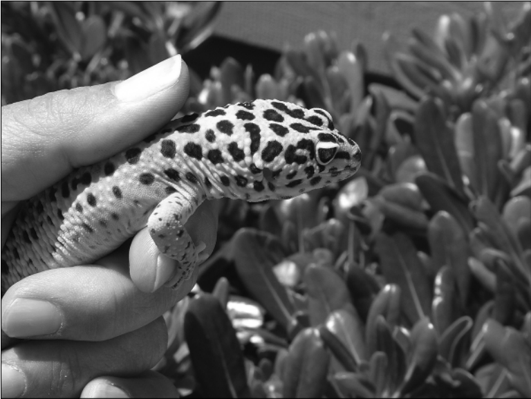
Figure 1-1: Leopard geckos are an attractive, calm, hardy pet species lizard.

Warfare has also taken its toll on leopard geckos. Throughout Afghanistan's history, from ancient times through the present, geckos have faced the horrors of war. Habitat destruction, either through the efforts of people fleeing warfare, or through the actions of warring people, has caused great harm to leopard geckos. However, as this book is written, leopard geckos are not an endangered species, primarily because of the efforts of captive breeding.