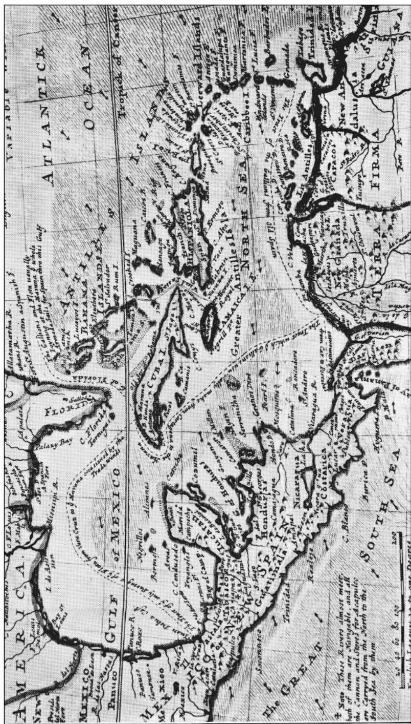
Technically the Spanish Main consisted of the Caribbean seaboard of South America, but in Blackbeard's day the name encompassed all Spanish dominions in the Caribbean. This map of 1720 shows the routes taken by the Spanish treasure flotas, while arrows show the direction of the prevailing wind.