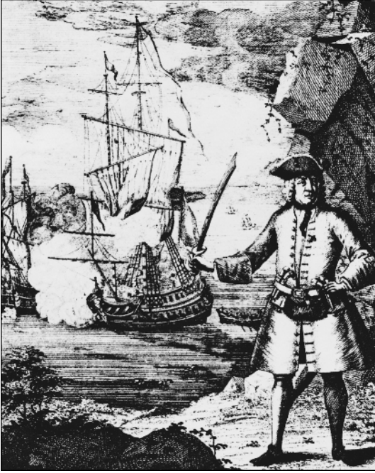
Henry Every (or Avery), the most successful pirate of them all. In 1694 he captured the flagship of an Indian mogul, then retired with his plunder. His success would have encouraged seamen like Blackbeard to follow in his footsteps.

unlimited prosperity. With both French and Spanish merchantmen to prey on, the English and Dutch privateers had the entire Caribbean basin to hunt in, and they made the most of their opportunity. This later privateering war was the one Blackbeard participated in, but as a youth he would have been weaned on sailors' stories of the rich pickings to be had on the far side of the Atlantic Ocean during the earlier decade-long round of fighting.