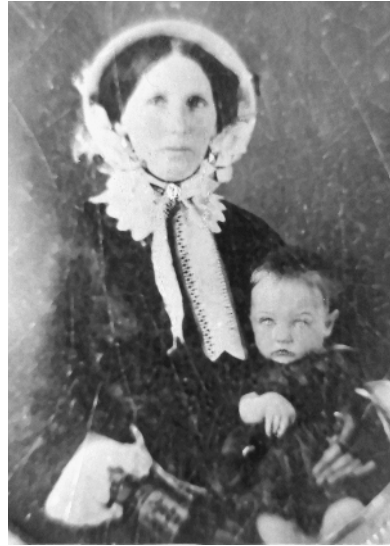
Alice Jane McKey Holliday and infant John Henry Holliday, circa 1852.