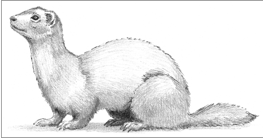
Figure 1-1: They may look like rodents, but ferrets are actually carnivores.