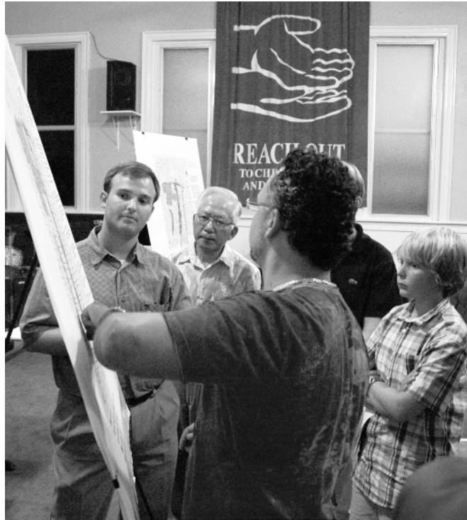
Residents participating in a planning workshop.

Stakeholder: Anyone who feels they have a stake in the decision because they will be affected by it or because they care about the outcome.