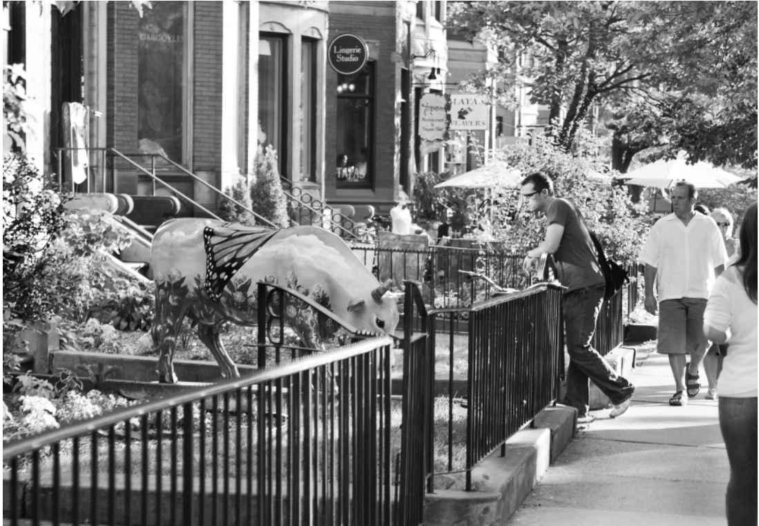
A lively street in Boston. This historic district has many of the elements that urban designers seek to re-create in newly developing areas.

The next chapter will provide more detail on the education of urban planners. Chapter 3 will review ways that a beginning planner can gain valuable job experience through internships and similar opportunities. Then, in Chapter 4, practicing planners will share their stories about the choices they made, the work they do, and the advice they offer to those interested in the profession.