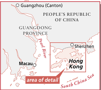
South China Sea