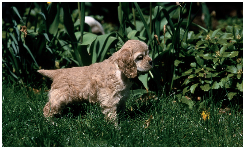
The Cocker is a hunting spaniel and retains that heritage, as can be seen in the instinctive stance of this little puppy.

The perfect Cocker Spaniel is a small, yet sturdy and strong dog. He's a hunting dog, and should always appear ready to go for a romp in the fields. His body is slightly longer (from breastbone to the back of the hips) than he is tall (from the ground to the highest point of the shoulders).