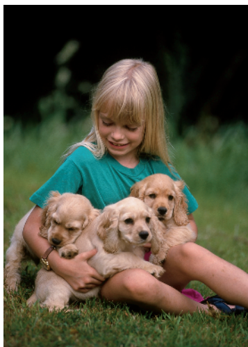
A well-socialized Cocker Spaniel is great with kids.