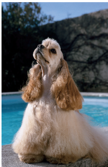
His luxurious coat is one of the Cocker's most elegant features. But it does require a lot of care.

This luscious coat does require a significant amount of care. That will be discussed in chapter 7.