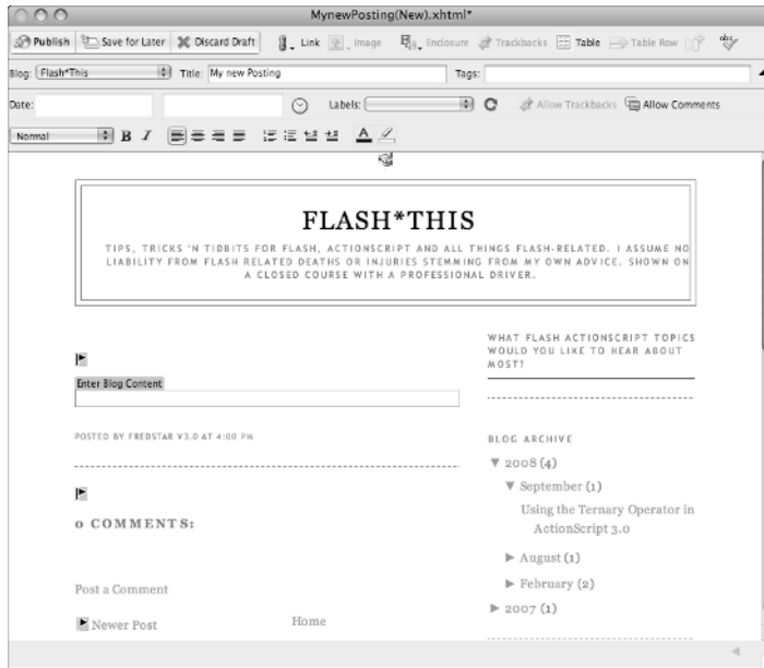
Figure 1-3: You can create and manage your blog entries directly from Contribute.