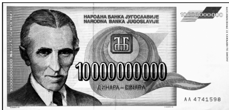
Exhibit 1.3 A high honor for Tesla from his homeland of Serbia—printed during a time (1993–1994) when hyperinflation was a devastating external fatigue factor for local entrepreneurs

trouble later in life when he faded from the limelight and died in relative poverty. Rather than wealth, Tesla sought the heroic path of the inventor who makes the world better. 8 He even voluntarily tore up his contract to spare George Westinghouse the burden of royalty payments to him after the “Current Wars” with Edison left Westinghouse financially strained. He wrote that the betterment of mankind was “the difficult task of the inventor who is often misunderstood and unrewarded. But he finds ample compensation in the pleasing exercises of his powers and in the knowledge of being one of that exceptionally privileged class without whom the race would have long ago perished in the bitter struggle against pitiless elements.” 9