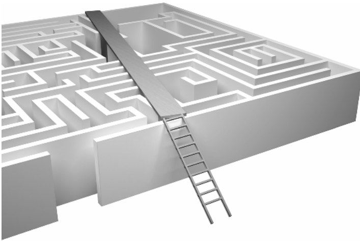
Exhibit 1.1 Are there better paths to avoid fatigue in the maze of innovation?

C onquering innovation fatigue begins with understanding the journey of innovators at a personal level. It begins with recognizing the “fatigue factors” they face and then seeking for solutions to help them reach success. A useful metaphor for the innovator’s journey