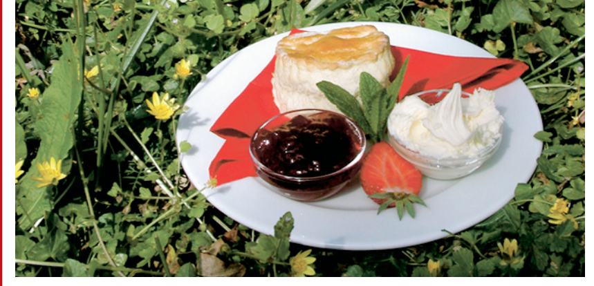
Traditional Cream Tea

established and brilliant. See p. 122 and p. 38.