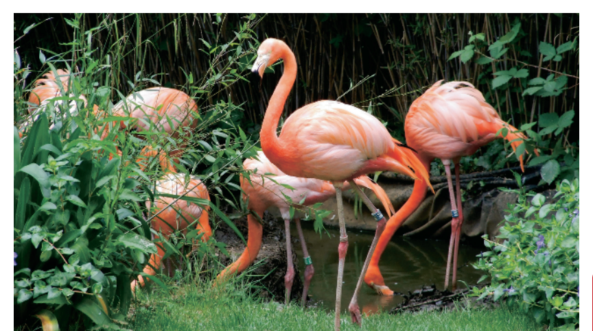
Paradise Park, Hayle

Best Forest Haldon Forest near Exeter: cycle tracks and walks, sculptures, special events for children – and good refreshments. See p. 96.