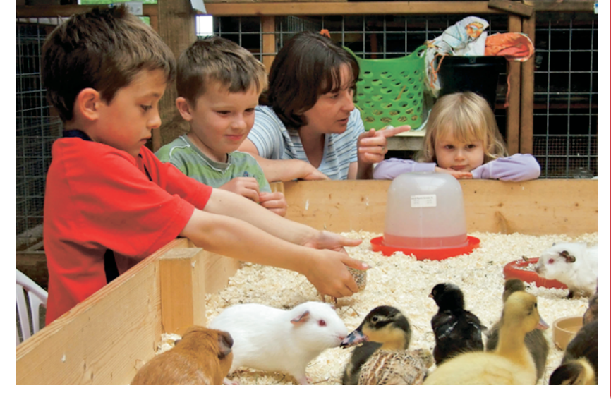
Torridge House, North Devon