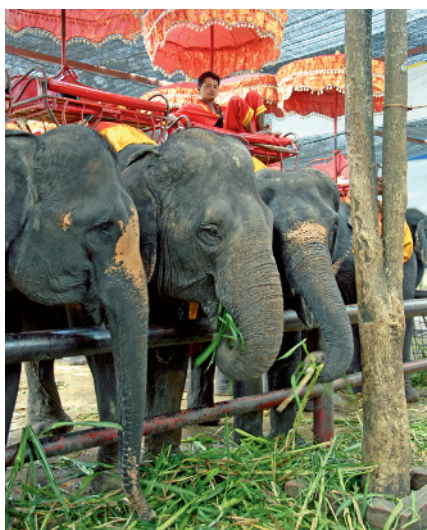
Elephants in Ayutthaya

ceremonies in temples mark the start of a new year, but generally, for most children, it's the waterfights they remember. In the north the endless drenching battles go on for days; the south, more reasonably, calls a truce after one day.