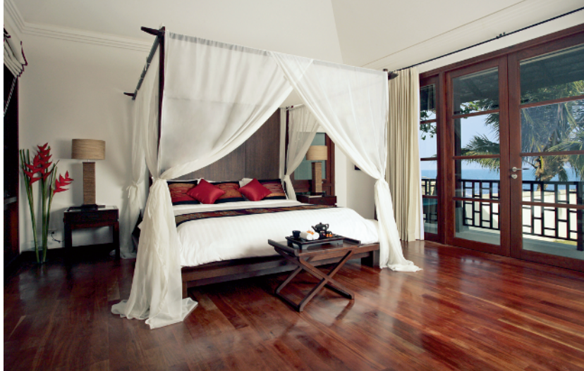
The ultimate private pad at Karma Sumai

member of the Laguna Resort complex, an ‘integrated resort’ of five leading resort hotels set on a beach and a series of inter-linked lagoons. Guests can shuttle around between all five hotels, and for a small fee make the most of their extensive facilities. This opens up 30 restaurants, 15 swimming pools and three spas. There’s an 18-hole golf course, a ‘Camp Laguna club’ teaching teenagers abseiling, rock climbing, tennis, horse riding and more. Facilities include a water-park, a marine centre with complimentary hobie cats, wind-surfers and instruction, children’s clubs for all ages, and two semi-resident elephants, Ann and baby Sara. See p 146.