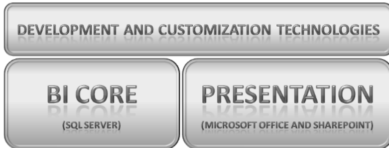
Figure 1-1: The three primary components of Microsoft BI technology.