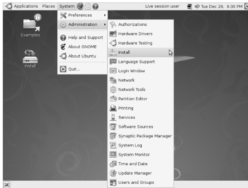
Figure 1-2: Hardy Heron's Live Desktop and install menu

If something goes wrong during the installation, you only have a few options for debugging the problem. After the graphical desktop appears, you can press Ctrl+Alt+F1 through Ctrl+Alt+F4 to provide command-line terminals. Ctrl+Alt+F7 returns to the graphical display. Otherwise, you may want to consider using the Alternate CD-ROM image for text-based installation.