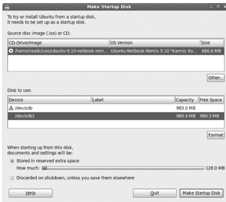
Figure 1-5: The usb-creator under Karmic Koala

The usb-creator program allows you to select the ISO image and destination device. (See Figure 1-5.) When it finishes the installation, you can connect the USB device (or SD Card) to your netbook and boot from it.