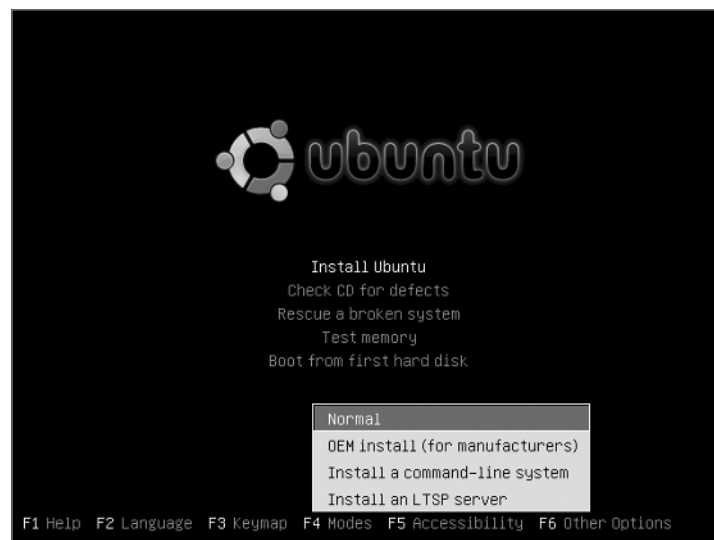
Figure 1-3: Hardy Heron's Alternate CD-ROM boot selection menu

The Alternate CD-ROM image enables you to install a desktop image with graphics disabled, or an OEM-configurable system (see Figure 1-3) by highlighting the Install option, pressing F4, and selecting a different install mode.