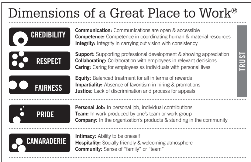
Figure 1.1 The Great Place to Work Model

Specifically, he identified the relationships between employees and their leaders, between employees and their jobs, and between employees and each other as the indicators of a great place to work. Relationships at work matter, and in particular, the centrality of these three relationships influenced people's loyalty, commitment, and willingness to contribute to organizational goals and priorities. If leaders implemented practices and created programs and policies that contributed to these three relationships, employees had a great workplace experience. It mattered less what the programs, policies, and practices were, and more that they were done in a way that strengthened relationships. The Great Place to Work Model (see Figure 1.1) was developed during this time by the Institute's founders, Robert Levering and Amy Lyman. The Model was later formalized and today has five dimensions, which form the core chapters of this book: Credibility, Respect, Fairness (which, put together, comprise Trust); Pride; and Camaraderie.