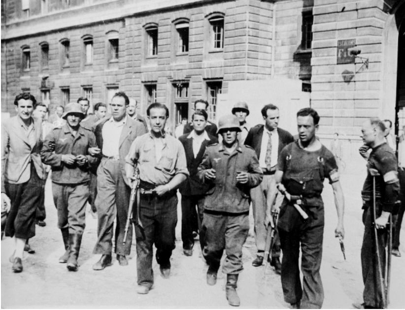
Figure 1.1 The liberation of Paris, August 25, 1944: surrender of German troops.

this new war alongside the 300,000 lost on the Eastern Front. Bulgaria and Finland followed suit in September.