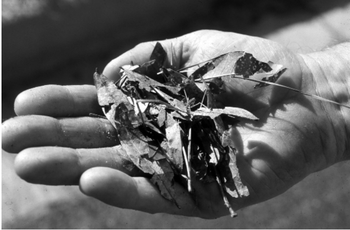
Figure 1.6 Layers of leaf fall can help to indicate the time period that has elapsed since the deposition of evidence

Time of death (time since death, post-mortem interval) can be estimated by the use of plants. Tree rings are one type of plant evidence being used for time of death estimation (Figure 1.7). If a woody plant with seasonal growth producing annual tree rings is found growing on a grave or growing through a skeleton, the annual rings can be counted. The number of rings, corresponding to a year per ring, can show that the grave or skeleton was at this location for at least that many years.