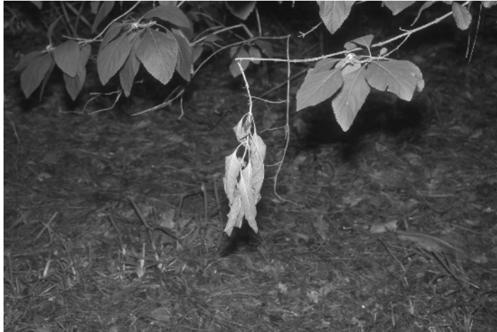
Figure 1.8 The amount of wilt present on broken or damaged leaves and branches can help to establish a time frame. (Please refer to the colour plate section.)

The time of an event can be determined using other plant characteristics. A broken branch usually will wilt. The amount of wilt can be determined experimentally if the evidence is photographed and collected correctly (Figure 1.8). The time for sap to dry after a branch is broken or bark is nicked can also be determined by experimentation. Leaf wilt can also occur when plants are uprooted or the root systems are severely disturbed. Determining the approximate time the sap has been accumulating or the leaf wilting depends on having a botanist at the scene quickly. As with most types of physical evidence, proper photography is essential. The botanist will need to determine the identification of the vegetation and conduct an experiment by breaking similar branches. By examination at regular intervals a botanist will be able to determine the relative time it takes the sap and/or wilt to match that shown in the photographs. For best results, several replications are necessary to get an average time period. The investigator should keep in mind that if conditions change between the time of discovery and when the experiment is started, the results may not be applicable. If parts of plants that are green (have photosynthesis) become buried, they will gradually lose their green color as the chlorophyll breaks down from the lack of sunlight. The color will gradually become yellow and eventually brown (Figure 1.9).