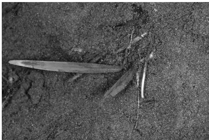
Figure 1.9 Chlorophyll degradation of plant leaf from a burial site can be used for time interval estimations. (Please refer to the colour plate section.)

procedure can be used to show the approximate time of the most recent burial. Likewise, it could show, after the body was moved, when the original burial took place. To be effective this experiment must be done under the same conditions at the scene where the plant material was discovered. The sooner the experiment can be started the more accurate the findings will be. Photographs of the yellowed plant parts must be of very high quality. The botanist must quickly match the vegetation and bury it, and each replication must be photographed at the time of burial and at the time of retrieval. As in any experiment, the more replications per time period, the better the results.