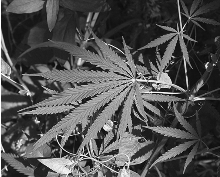
Figure 1.3 Marijuana leaf ( Cannabis sativa L.), a plant which the United States government considers to be a controlled substance. Penalties for possession can be imposed based on total weight or number of plants.

marijuana. Identification of these plants is crucial for law enforcement. Examples of plants needing biological identification are plants listed as illegal drugs, dangerous agricultural weeds, and exotic species known to invade and destroy native habitats. A very large responsibility at all points of entrance to countries is that of illegal plant identification. All imported goods should be inspected for the many types of illegal plants and their parts. Suspected importation of harmful drugs, prohibited medicines, invasive weeds, including the seeds of prohibited plants (Figure 1.4), all need to be verified before interdiction can occur. Illegal plants are often found as fragments or as seeds or seedlings in shipments of other products such as grain or ornamental plants. Almost no-one can absolutely identify all the various plants that travel around the world with humans, and the identification of the various parts of those plants is even more difficult. Often such identifications go beyond the scope of law enforcement and border protection, and specialists are often needed.