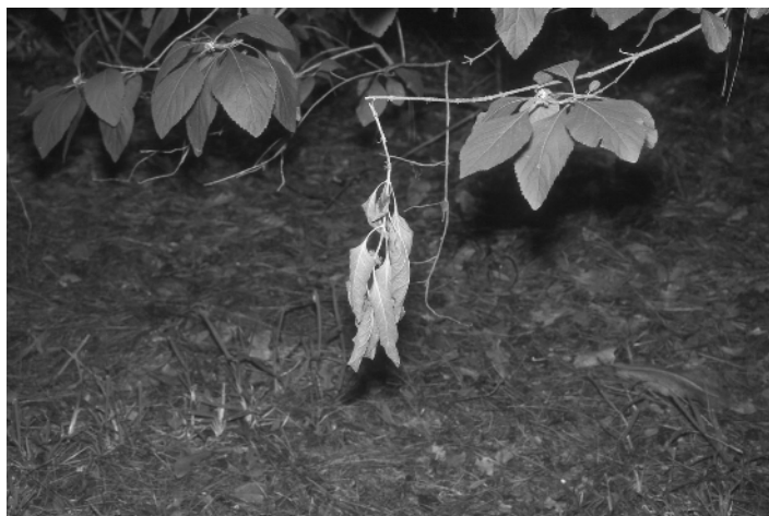
Figure 1.8 The amount of wilt present on broken or damaged leaves and branches can help to establish a time frame. (Please refer to the colour plate section.)

The time of an event can be determined using other plant characteristics. A broken branch usually will wilt. The amount of wilt can be determined experimentally if the evidence is photographed and collected correctly (Figure 1.8). The time for sap to dry after a branch is broken or bark is nicked can also be determined by experimentation. Leaf wilt can also occur when plants are uprooted or the root systems are severely disturbed. Determining the approximate time the sap has been accumulating or the leaf wilting depends on having a botanist at the scene quickly. As with most types of physical evidence, proper photography is essential. The botanist will need to determine the identification of the vegetation and conduct an experiment by breaking similar branches. By examination at regular intervals a botanist will be able to determine the relative time it takes the sap and/or wilt to match that shown in the photographs. For best results, several replications are necessary to get an average time period. The investigator should keep in mind that if conditions change between the time of discovery and when the experiment is started, the results may not be applicable. If parts of plants that are green (have photosynthesis) become buried, they will gradually lose their green color as the chlorophyll breaks down from the lack of sunlight. The color will gradually become yellow and eventually brown (Figure 1.9).