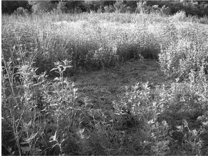
Figure 1.10 Area of decomposition and the resulting lack of vegetation. Over time, plant growth will reoccur.

fed by the part away from the body. Second, fluids left by deterioration are caustic to plants. Most stems and root systems would eventually die because of the caustic fluids and lack of photosynthesis. Also, the fluids will prevent other plants from colonizing the soil (Figure 1.10).