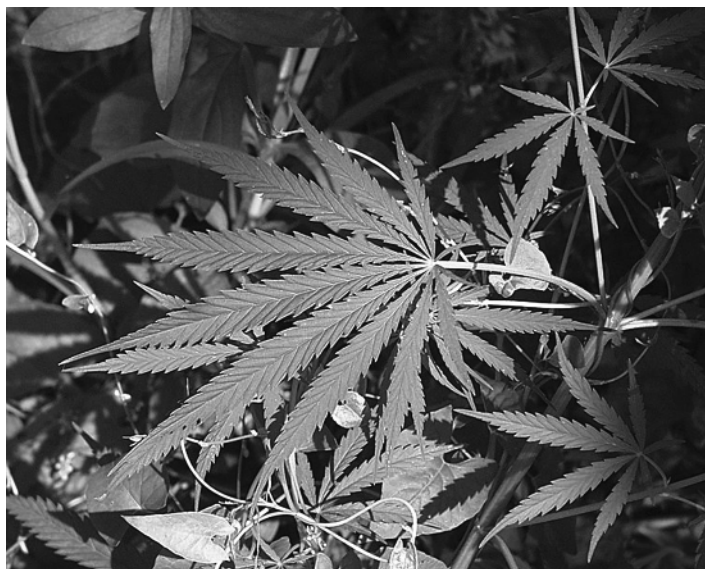
Figure 1.3 Marijuana leaf ( Cannabis sativa L.), a plant which the United States government considers to be a controlled substance. Penalties for possession can be imposed based on total weight or number of plants.

marijuana. Identification of these plants is crucial for law enforcement. Examples of plants needing biological identification are plants listed as illegal drugs, dangerous agricultural weeds, and exotic species known to invade and destroy native habitats. A very large responsibility at all points of entrance to countries is that of illegal plant identification. All imported goods should be inspected for the many types of illegal plants and their parts. Suspected importation of harmful drugs, prohibited medicines, invasive weeds, including the seeds of prohibited plants (Figure 1.4), all need to be verified before interdiction can occur. Illegal plants are often found as fragments or as seeds or seedlings in shipments of other products such as grain or ornamental plants. Almost no-one can absolutely identify all the various plants that travel around the world with humans, and the identification of the various parts of those plants is even more difficult. Often such identifications go beyond the scope of law enforcement and border protection, and specialists are often needed.