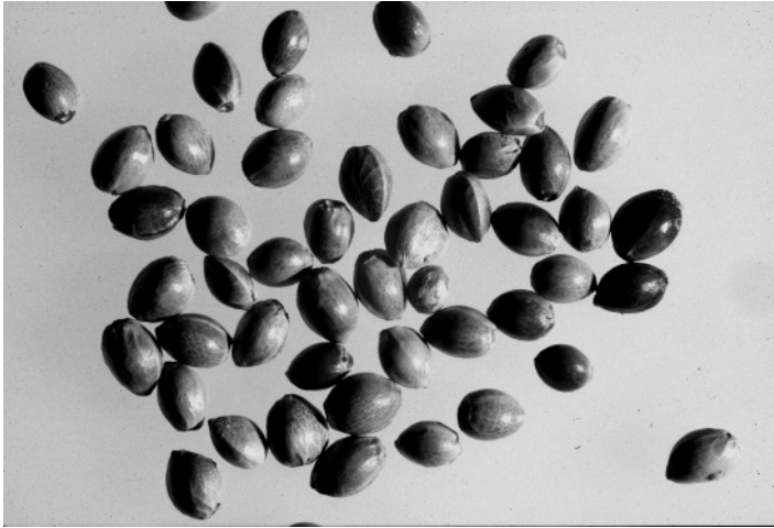
Figure 1.4 Marijuana seeds ( Cannabis sativa L.) are often not recognized by law enforcement personnel due to their similar appearance to many other plant seeds.

their hallucinogenic effects can be illegal. While rare plants are not protected from destruction on private property, transportation of them without proper permits is a violation of international, federal, state, and local laws. The rationale for the regulation of the transportation but lack of penalties for the destruction of any protected plants naturally occurring on your property stems from old English law. In essence, if it grows on your property, you own it, but transportation on public roads can be regulated.