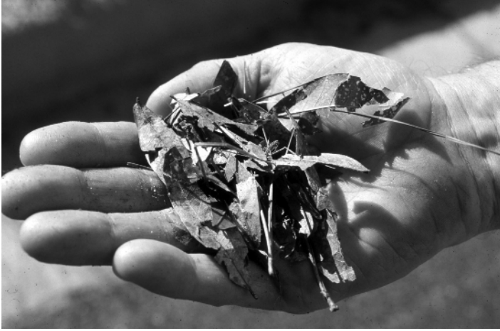
Figure 1.6 Layers of leaf fall can help to indicate the time period that has elapsed since the deposition of evidence

Time of death (time since death, post-mortem interval) can be estimated by the use of plants. Tree rings are one type of plant evidence being used for time of death estimation (Figure 1.7). If a woody plant with seasonal growth producing annual tree rings is found growing on a grave or growing through a skeleton, the annual rings can be counted. The number of rings, corresponding to a year per ring, can show that the grave or skeleton was at this location for at least that many years.