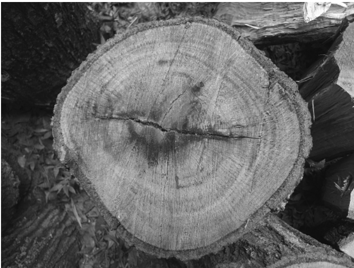
Figure 1.7 Tree rings are one type of plant evidence used for time of death estimation.

Time of death (time since death, post-mortem interval) can be estimated by the use of plants. Tree rings are one type of plant evidence being used for time of death estimation (Figure 1.7). If a woody plant with seasonal growth producing annual tree rings is found growing on a grave or growing through a skeleton, the annual rings can be counted. The number of rings, corresponding to a year per ring, can show that the grave or skeleton was at this location for at least that many years.