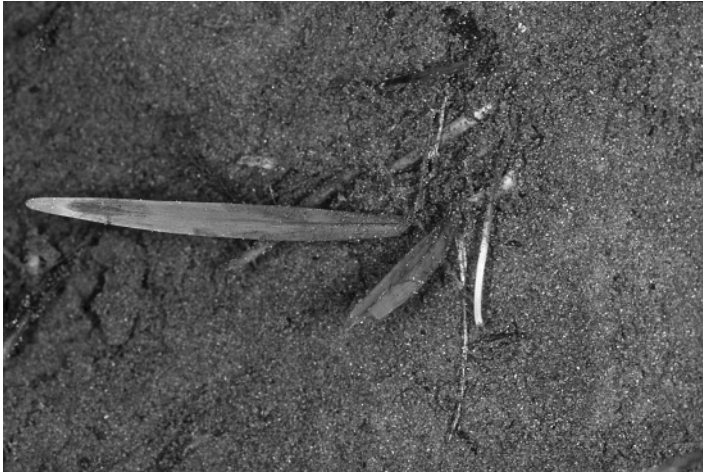
Figure 1.9 Chlorophyll degradation of plant leaf from a burial site can be used for time interval estimations. (Please refer to the colour plate section.)

procedure can be used to show the approximate time of the most recent burial. Likewise, it could show, after the body was moved, when the original burial took place. To be effective this experiment must be done under the same conditions at the scene where the plant material was discovered. The sooner the experiment can be started the more accurate the findings will be. Photographs of the yellowed plant parts must be of very high quality. The botanist must quickly match the vegetation and bury it, and each replication must be photographed at the time of burial and at the time of retrieval. As in any experiment, the more replications per time period, the better the results.