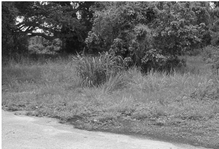
Figure 1.11 Vigorous plant growth over a grave site due to soil disturbance from a burial.

fed by the part away from the body. Second, fluids left by deterioration are caustic to plants. Most stems and root systems would eventually die because of the caustic fluids and lack of photosynthesis. Also, the fluids will prevent other plants from colonizing the soil (Figure 1.10).