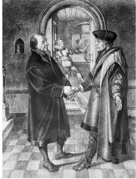
Figure 1.2 Erasmus of Rotterdam in the print shop of his friend Johannes Froben of Basle.

commentary on the text in the form of annotations. The work was widely used by those sympathetic to the cause of the Reformation. For the reformers – especially Luther and his colleagues at Wittenberg – the religious ideas of the Reformation drew largely on the Bible and Augustine. The advent of printing, linked with increasingly effective bookselling methods, meant that accurate and reliable texts of both these sources were widely available, thus facilitating both the initial development and the subsequent spread of these ideas.