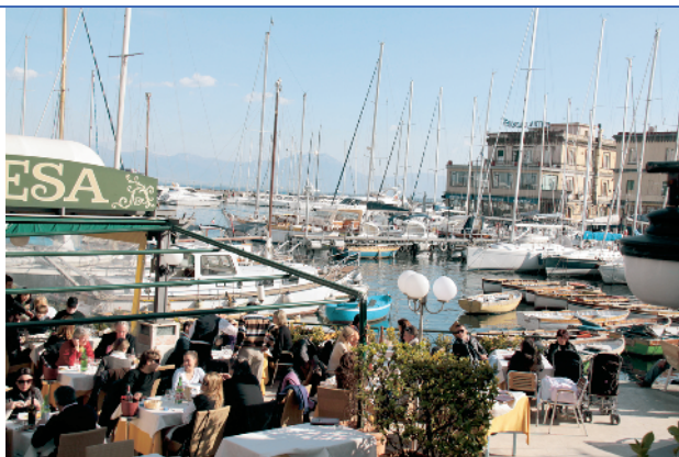
Al fresco lunch overlooking Borgo Marinari.

T here's a lot to see in this book: one of Italy's biggest cities full of extraordinary art treasures, a spectacular coastal drive, the many marvels of the ancient world, and mainland Europe's only active volcano. And I haven't even mentioned food, wine, lazing on the beach, or simply gazing at the scenery. Here are some suggestions for making the most of your time in Campania.