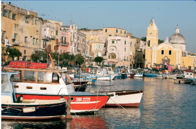
Procida's bustling port of Marina Grande.