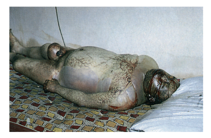
Figure 1.7 Late bloat stage of decomposition. The body is about 7 days old and exhibits pronounced swelling owing to accumulation of gas. Note discoloration of the skin and exudates from the mouth and nose.

The decomposing tissues release green substances and gas which make the skin discoloured and blistered, starting on the abdomen in the area above the caecum (Fig. 1.7). The front of the body swells, the tongue may protrude and fluid from the lungs oozes out of the mouth and nostrils (Fig. 1.8). This is accompanied by a terrible smell as gasses such as hydrogen sulphide and mercaptans, sulphurcontaining organic molecules, are produced as end products of bacterial metabolism. Methane (which does not smell) is also produced in large quantities and contributes to the swelling of the body. In the UK, this stage is reached after about 4-6 days during spring and summer but would take longer during colder winter weather. The accumulation of gas can become so severe that the abdominal wall ruptures and this may lead to concerns over whether the wound was caused maliciously. In 1547, the corpse of King Henry VIII underwent such extreme bloat that his coffin, which was being transported back to Windsor castle for burial, exploded overnight and dogs were found feeding on the exposed remains in the morning. This was deemed to be divine judgement on the king for his dissolution of the monasteries.