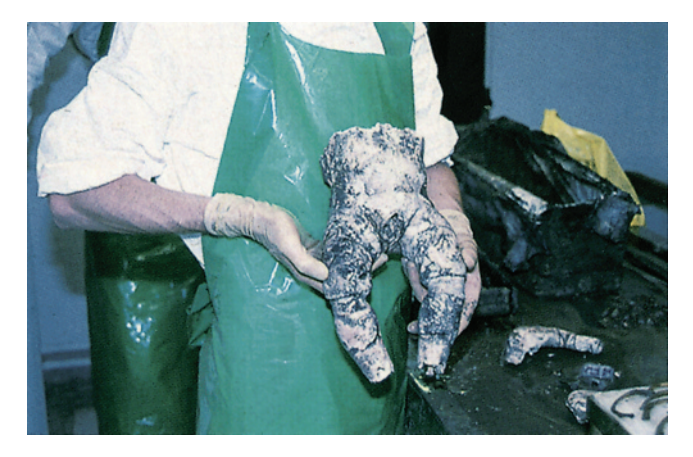
Figure 1.10 The formation of adipocere has preserved the body of this child despite it being buried for about 3 years.

paste-like to crumbly. Extensive adipocere formation inhibits further decomposition and ensures that the body is preserved for many years (Fig. 1.10). Adipocere formation is therefore a nuisance in municipal graveyards because it prevents the authorities from recycling grave plots but very useful to forensic scientists and archaeologists who wish to autopsy long-dead bodies.