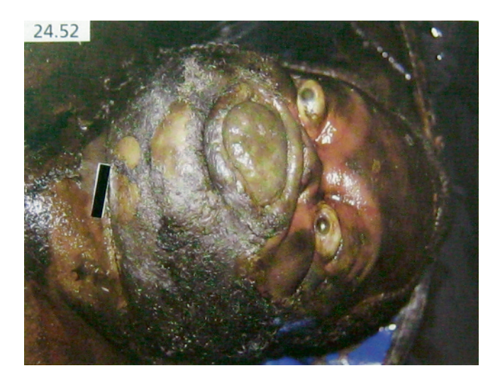
Figure 1.8 Late bloat stage of decomposition. Note how the swelling has made recognition of facial features impossible. The tongue is forced out and the eyeballs bulge as a consequence of internal pressures. These are normal decomposition features and should not be taken as an indication of asphyxiation. (Reproduced from Dolinak, D. et al. , (2005) Forensic Pathology Theory and Practice . Copyright © 2005, Elsevier Academic Press.)