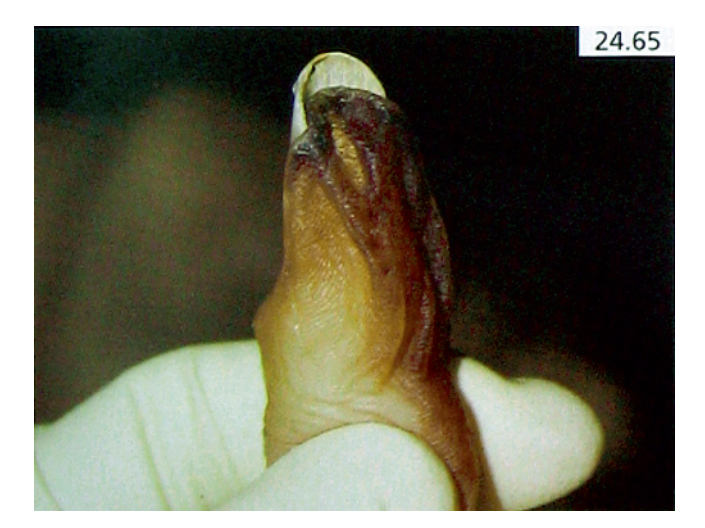
Figure 1.1 Mummified fingertip. The drying and retraction of the surrounding skin makes the fingernail appear longer and hence the common perception that after death nails continue to grow. The drying of the skin can make taking fingerprints impossible. (Reproduced from Dolinak, D. et al. , (2005) Forensic Pathology Theory and Practice . Copyright © 2005, Elsevier Academic Press.)