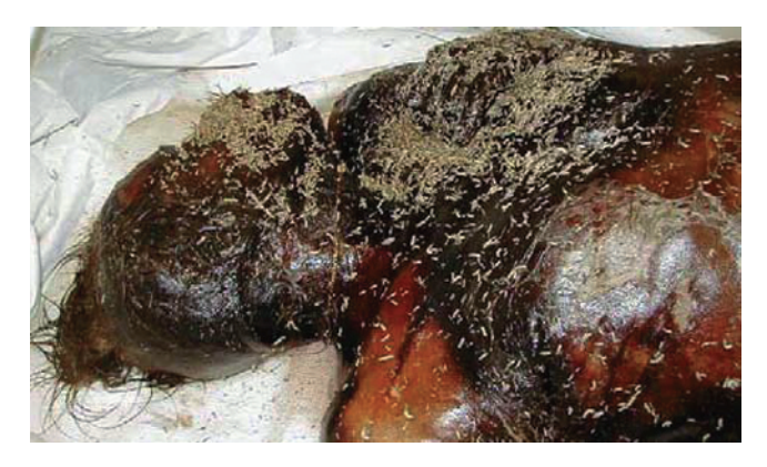
Figure 1.9 Blowfly maggots developing upon a corpse. Note how mature maggots can be seen crawling over the surface and the discoloration of the skin. (Reproduced from Klotzbach, H. et al. , (2004) Information is everything – a case report demonstrating the necessity of entomological knowledge at the crime scene. Agrawal's Internet Journal of Forensic Medicine and Toxicology , 5 , 19–21. Copyright © 2004, with permission from Elsevier.)