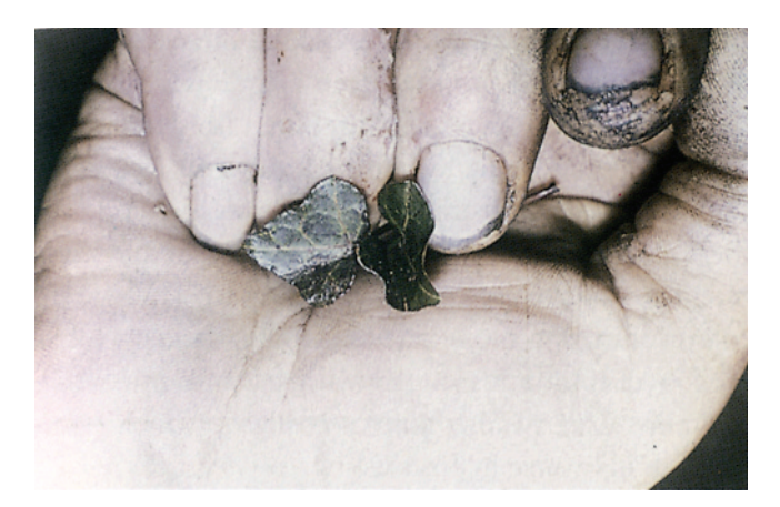
Figure 1.5 Cadaveric rigidity. This person grasped at vegetation before falling into water. (Reproduced from Shepherd, R. (2003) Simpson's Forensic Medicine , 12th edn. Copyright 2003, Hodder Arnold, London.)