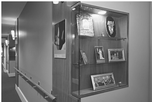
FIGURE 1-6 Memory boxes inset beside residents' bedroom doors assist with wayfinding.

enjoyment. These quality of life elements were translated into a variety of design decisions. “Autonomy,” for example, is expressed through the inclusion of lit memory boxes for display of photographs and mementoes outside resident rooms, affirming the unique history of each resident and assisting with wayfinding. “Meaningful activity” is realized through the location of residential scale therapy and activity kitchens in the neighborhoods for use by residents. “Dignity” is accomplished by the inclusion of private occupancy rooms with en-suite baths, as the design team firmly believed shared bathrooms compromise privacy.