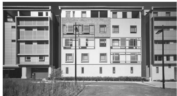
FIGURE 1-4 The façade is "patchworked" using brick, glass, and steel to reflect the surrounding streetscape and reduce the building's scale.

The scheme is spread over five stories, the lowest is below ground and is the service area that includes a hotel-inspired kosher kitchen, a large industrial-scaled laundry, and the building's mechanical systems. In addition, there is under-building parking that is accessed at this level. The main entrance is located on the ground floor, as is the assisted living dementia-specific unit. The third level is made up of frail, aged assisted living places and a dementia-specific high care unit. The fourth floor is dedicated to frail, aged skilled nursing and the fifth floor to frail, aged assisted care. Each floor houses 15 residents, making up what is referred to as a "neighborhood." Twenty common room spaces are distributed across the four residential floors, usually located at the ends of the buildings to capture sunlight.