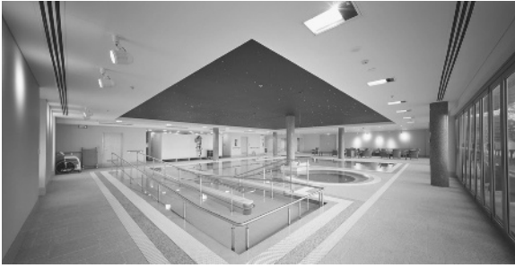
FIGURE 1-8 Montefiore's hydrotherapy center where the ceiling is pierced with fiber optic cables to give a "night sky" effect.

suggests the culture of honoring elders and the tremendous pride the community has in the Home.