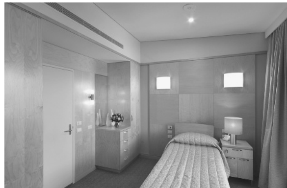
FIGURE 1-9 The "Classic" or entry-level room has an en-suite bathroom and kitchenette.

The Home has also taken an innovative approach to the shared past of many of its residents. Australia is home to approximately 35,000 European survivors of the Holocaust, the largest number of survivors per capita of any country's population outside of Israel. About one-third of the residents at Montefiore are Holocaust survivors and there are, in addition, those who make up the "second generation," or children of survivors, who feel that the Holocaust is the single event that has had the