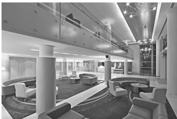
FIGURE 1-7 The aesthetic detail in the grand entry foyer includes the valance suspended from the ceiling, hand-covered with silver foil as well as artworks from iconic Australian artists.

A “sense of home” is integral to creating an environment conducive to residents feeling like they belong. The Montefiore scheme has concentrated on expressing “home” through its interior design selections. Of all the included Australian case studies, this scheme has the most expensive finishes and furnishings. There is a sense of the “grand,” the color schemes are subtly modulated and the corridors have become galleries of original works by iconic Australian artists. In the entry foyer a large window valance suspended from the ceiling was painstakingly hand-covered with silver foil. The ceiling of the hydrotherapy center is pierced with fiber optic cables to give a very effective night sky effect. Timber woven into lattices is used extensively to screen off particular areas without closing them off. All of this reinforces and