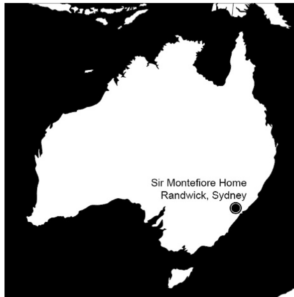
FIGURE 1-2 Scheme location. Courtesy of Pozzoni LLP