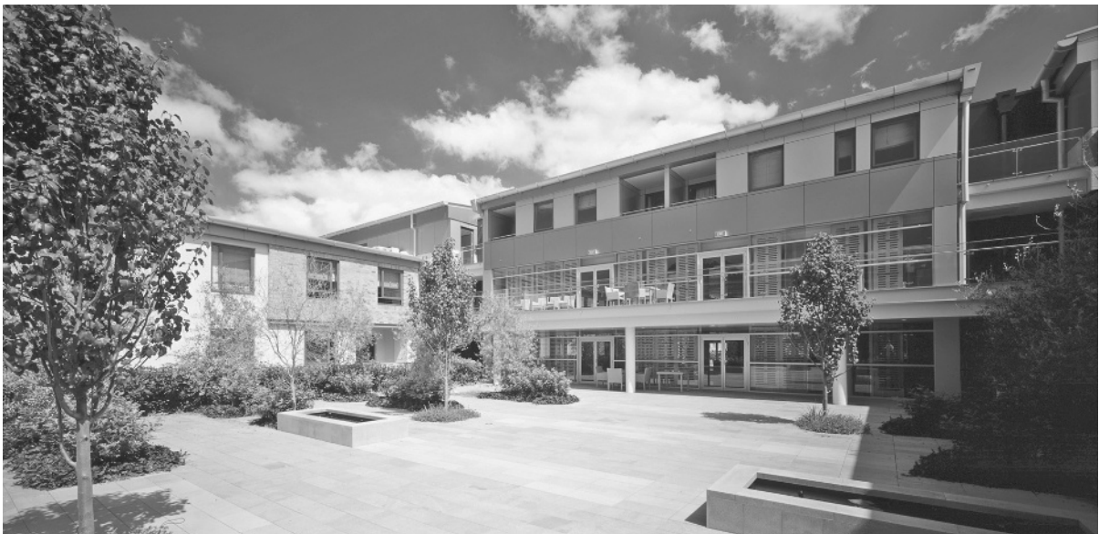
FIGURE 1-10 Montefiore's Winter Courtyard is one of numerous courtyards and gardens across the site.

The Montefiore scheme has a mixture of courtyards and open communal gardens. The dementia-specific units have direct access to the gardens, and there are separate courtyards for the assisted living and nursing home units. Some suites for assisted living residents