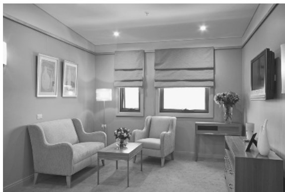
FIGURE 1-5 In the “Deluxe Room” residents have a separate lounge and access to a balcony.

Three distinctly different urban areas surround the Home's site. To the north is a low-scale historically protected residential area separated from the site by a narrow street. Medium-density housing of varying scales occupies the east and south. The western boundary of the site adjoins a precinct for large-scale development including low-rise housing and university workshops. The site's natural topography has been used to lessen the impact of the five-story structure. A two- or three-story building is presented to the residential flanks on the east depending on where the residential neighbor is located, south and north, while the five stories look over the university workshops. The scheme successfully negotiates between the changing contexts, and in this way respects the surrounding streetscape, but maximizes the development potential of the site.