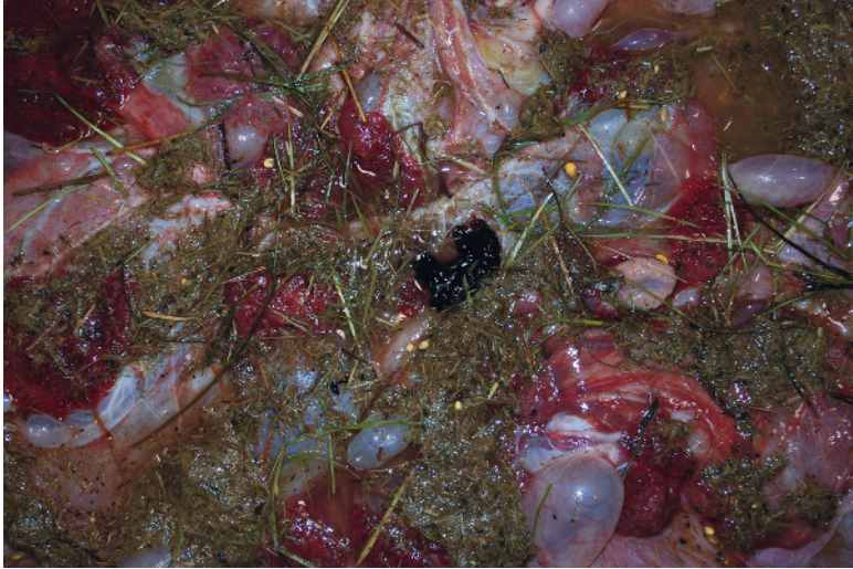
Figure 1.1 Contaminated bovine placenta. Fetal membranes are commonly contaminated at the time of collection for submission.

variety of genetic disorders or exposure to poisonous plants. Finally, lesions may be observed in the fetal membranes that may be an indication of fetomaternal interface disease, either the result of systemic maternal disease or ascending disease processes.