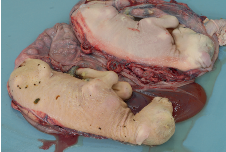
Figure 1.2 Meconium-stained ovine fetus. Two fetuses are present in the image. The fetus in the lower left is stained yellow-brown with flecks of brown meconium over its hair coat. This is an indication of in utero stress, likely the result of fetal hypoxia. The twin lamb has a whiter hair coat, with no evidence of meconium staining.

small pelvic diameter, or possible nutritional deficiencies can result in fetal stress or eventually death. Presumably as a response to fetal hypoxia, the best indication of periparturient fetal stress is relaxation of the anus with release of meconium. This results in orange-brown to orange-yellow discoloration to the fetus (Figure 1.2). In fetuses that die, similar material can be found in the lungs, histologically, indicating aspiration of the meconium during the periparturient period.