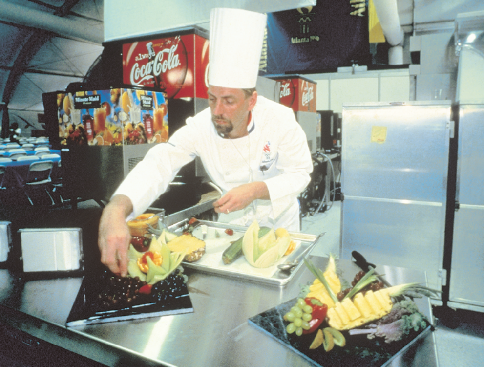
High-volume food service depends on a highly skilled team made up of both front-of-the-house and back-of-the-house associates.

The market is often local, and the emphasis is on face-to-face contact with the guest. Hospitality operations also tend to be smaller (with some obvious exceptions), so the problems of a large bureaucracy are not as significant as the problems of face-to-face relationships with employees and guests. Moreover, the hospitality industry has a number of unique characteristics. People work weekends and odd hours. We are expected by both guests and fellow workers to be friendly and cheerful. Furthermore, we are expected to care what happens to the guest. Our product, we will argue in a later chapter, is really the guest's experience. Additionally, the industry has its own unique culture. An important task of both schooling and work experience, then, is that of acculturating people to the work and life of hospitality industry professionals.