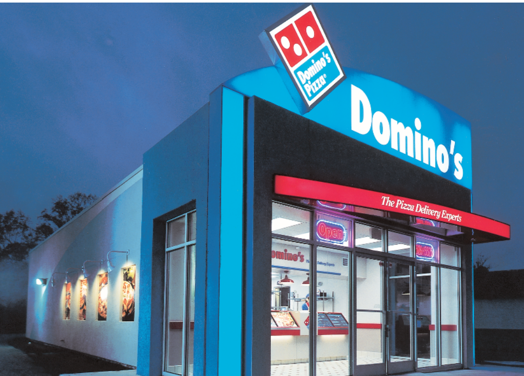
Hospitality takes many forms including fast growing areas such as takeout and delivery.

There is another important point to consider about retained earnings and the benefit mix. Often the only part-time jobs in the industry available to students are unskilled