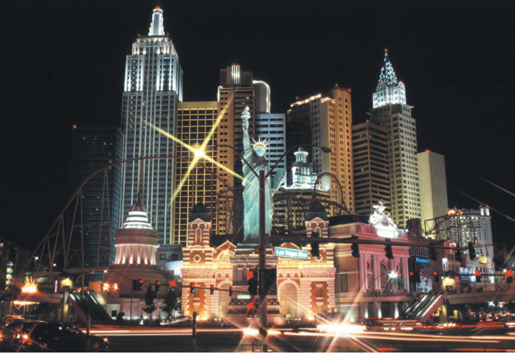
The New York, New York Casino in Las Vegas captures the feel of the original.

Networking occurs both formally and informally—often at industry functions, chapter meetings, and the like. Or you may find it necessary to “pound the pavement,” making personal appearances in places where you would like to work.