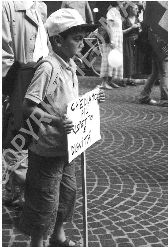
Plate 1 Immigrant demonstration in Italy, July 2000. The banner says: "We claim more respect and dignity."