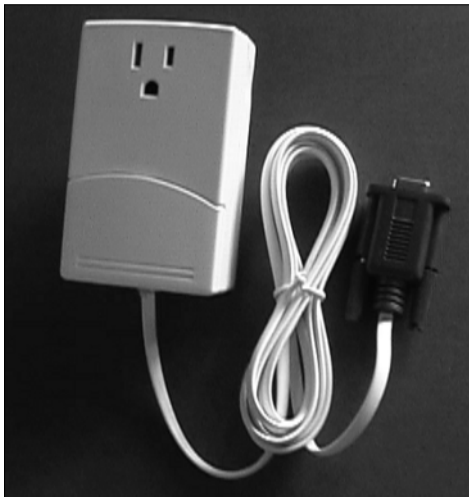
Figure 1-2: You can use the CM11A X10 computer interface with free Linux software to control your X10 modules.