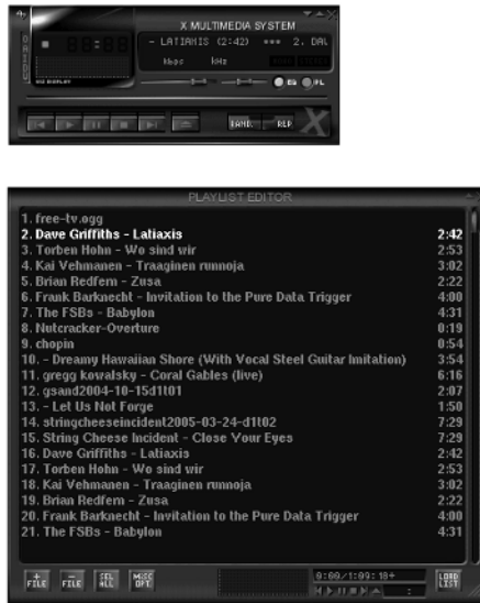
Figure 1-4: Your Anywhere Remote interfaces with the MP3 player software package, XMMS.