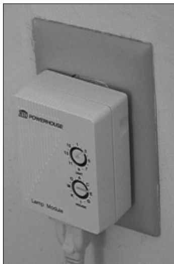
Figure 1-1: Use the X10 Lamp Module to control a light by using various X10 controllers.

To use an X10 module, you plug in the lamp (or appliance) or screw a light bulb into it, and then you plug (or wire) the module into the wall or screw it into a lamp socket. These X10 modules interpret the X10 signal and determine whether the signal is meant for it, and if so, it can turn itself on or off or dim the light accordingly, based on the signal.