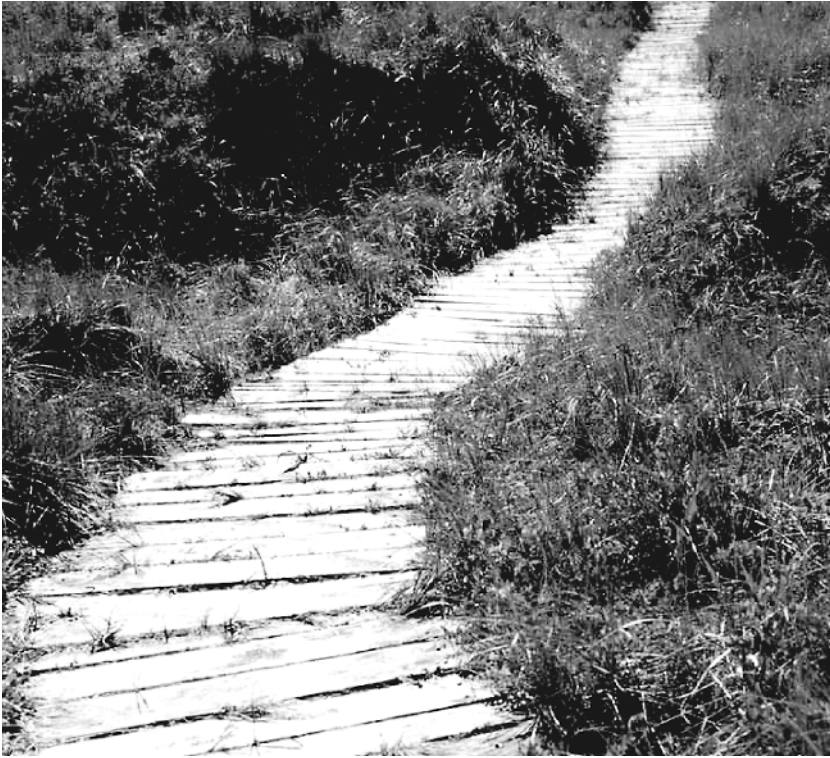
EXHIBIT 1.1. THE WINDING PATH.