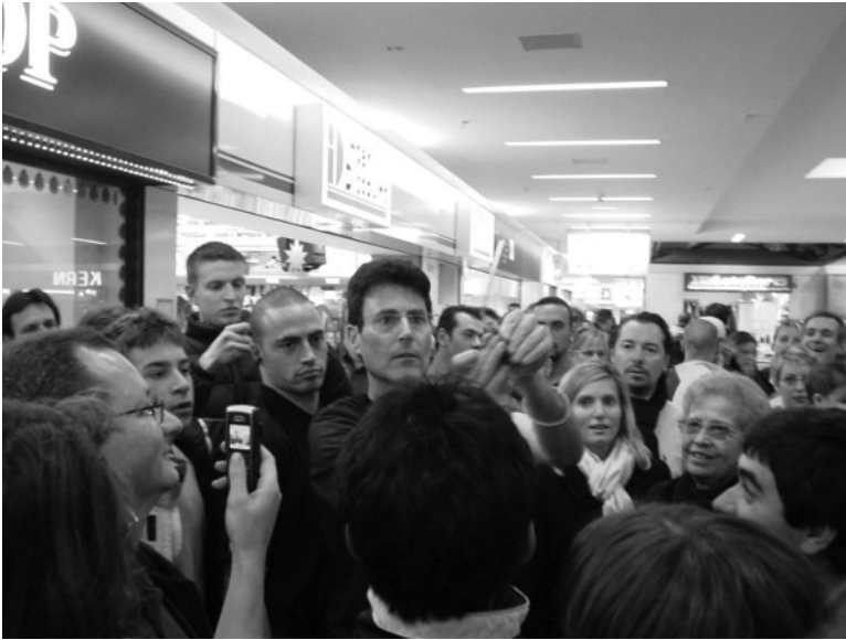
FIGURE 1.1. Photo of Geller.