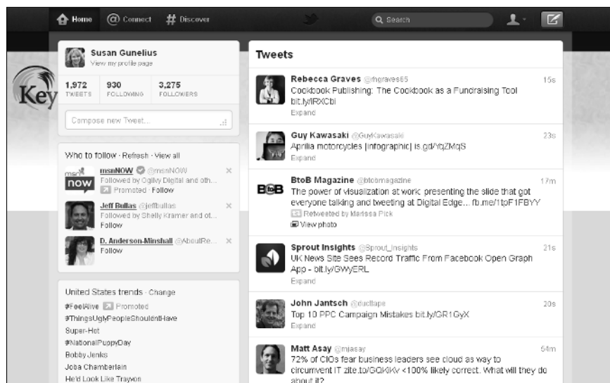
Figure 1-1: A Twitter account home page.

Of course, microblogging gets a bit more complex than that. For example, you can use special characters and phrases to share information through microblogging. You can send people direct messages, participate in live microblogging events, and more. Although it might seem like microblogging is just one more fad to add to the growing list of online applications and tools that clutter your desktop, many people find great value in it as a tool to connect with friends, meet new people, network, build business relationships, sell products, provide customer service, and much more.