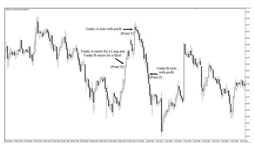
FIGURE 5.1 Traders Making Profit at Different Exit Prices