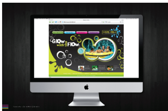
FIGS. 1–7 AND 1–8 This awesome billboard and Web site interface mock-up was designed by Angelica Leon. Observe how consistently the pieces work together.