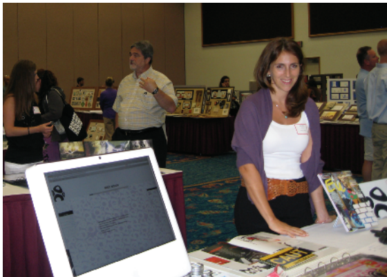
FIG. 1-1 Preparation is the key to a successful portfolio.

Obviously, you need to feel comfortable in the job environment, and the company must have confidence in you as well. A job almost always requires a match of personalities—yours and the potential employer's. I once took an interview at a community