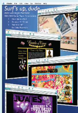
FIG. 1–15 I created this poster to promote a class in Web design. It demonstrates that portfolio opportunities are always available. Don't hesitate to volunteer your design services. It will help you to develop new port pieces.

Throughout this book, you will find all types of techniques to assist you in your job search, including the creation of traditional paper résumés, interactive CDs and DVDs, and even Web sites. Just remember, there are still more ways to find jobs, some of which are very twenty-first century. E-mail, blogs, job search sites, video résumés, and online networking sites are just as important as your portfolio. These new methods for finding jobs are discussed as well in the upcoming chapters. Figure 1–15 is a poster I designed.