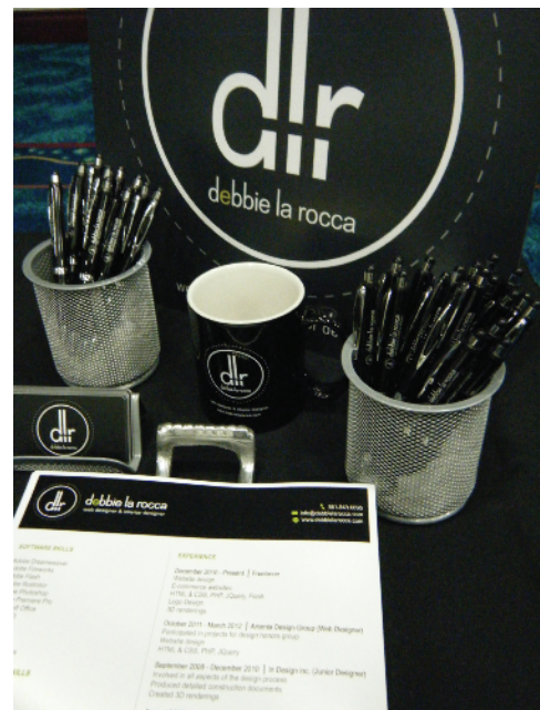
FIG. 1-13 This corporate identification package, created by Debbie La Rocca, illustrates her consistent use of color, type, and design elements.