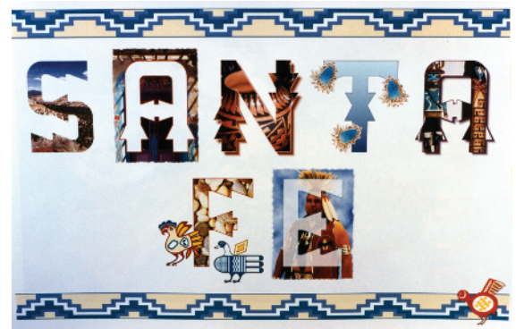
FIG. 1–4 This project, which I created to promote a study-related trip, demonstrates that portfolio opportunities are always available. Don’t hesitate to volunteer your services as a designer.