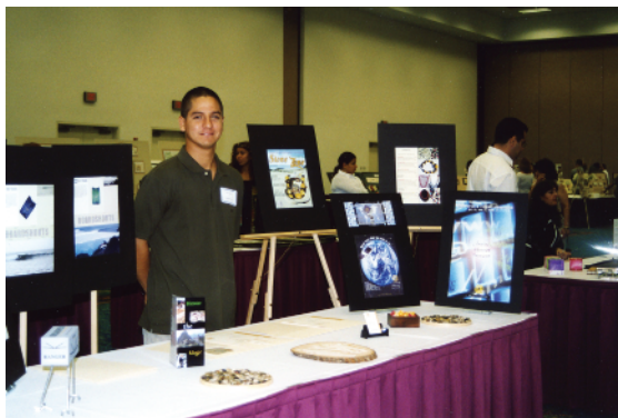
FIG. 1–14 Make eye contact and demonstrate your confidence. You would be amazed how many people cannot look you in the eye! Practice in front of a mirror if necessary, but do be ready when the time comes.

The most important thing to remember when creating a portfolio is to ensure that your work