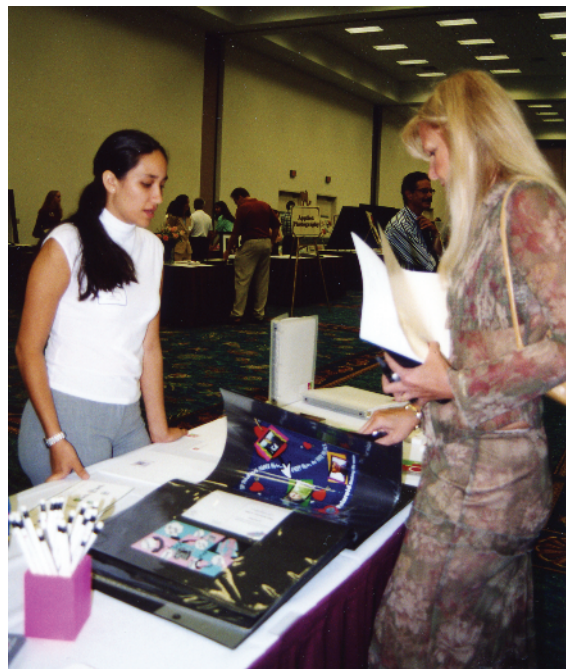
FIG. 1-2 Be prepared to discuss your art. You will be asked to explain why you created a piece in a certain way. Your ability to articulate an answer can influence how you are perceived as an artist and Web designer.