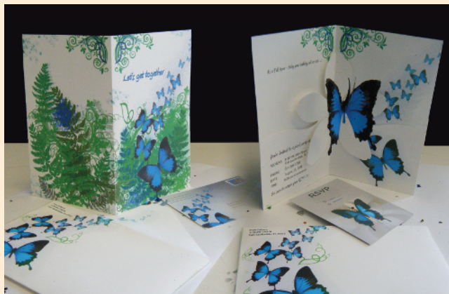
FIG. 1–20 This lovely 3-D pop-up card, designed by Fran Cahoon, is a terrific way to get your name out into the industry. Add your name and e-mail on the back for instant recognition.

Can you design a unique invitation to a party or an event? It's time to starting thinking outside the box! Research different styles of invitations. Sketch some designs and try your hand at creating an extreme invitation. Consider using multiple folds or unusual shapes. Don't forget to include the important information—such as the date, time, telephone number, and place (fig. 1–20).