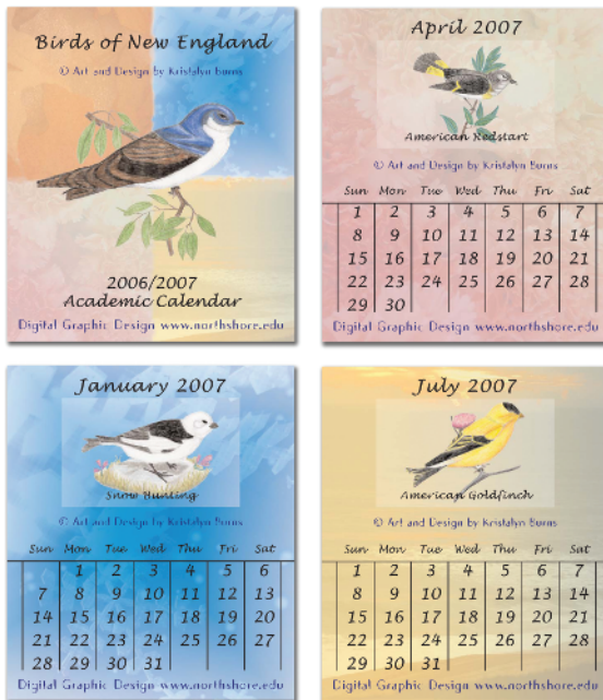
FIG. 1-12 This beautiful calendar, created by Kristalyn L. Burns, not only showcases her ability to illustrate but also demonstrates that she understands how the illustration will look in print.

Although every design portfolio will look different depending on the field, the basic objective is always the same: to create a portfolio that demonstrates your unique ability.