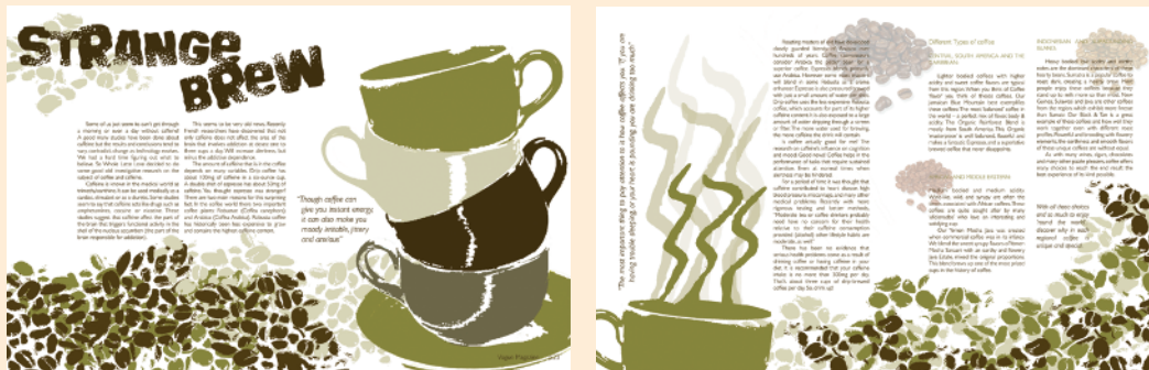
FIGS. 1–18 AND 1–19 Cynthia Grynspan invents a great solution for this designer's challenge. Her editorial is engaging and shows a marvelous color set.

Create a four-page editorial spread, using highly stylized images or your own illustrations. The designs should exhibit a sophisticated collection of colors and fonts. Don't forget to such add elements as an author, magazine name, month and year of publication, and page numbers (figs. 1–18 and 1–19).