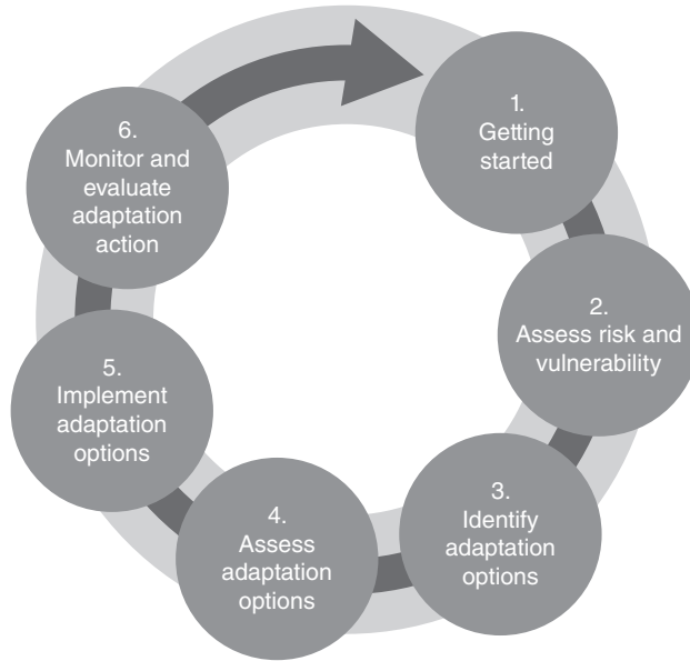
Figure 1.2 Planning cycle for climate adaptation (EEA (European Environment Agency), 2012: 74).

can be identified across developing and developed nations (IPCC (Intergovernmental Panel on Climate Change), 2014a 887 f.):