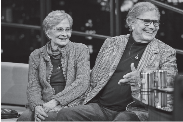
Figure 1.1 Glória Menezes and Tarcísio Meira.

narrative serials in the feuilleton or folhetim tradition that were broadcast starting in the early 1940s. The radionovela began to fade out with the consolidation of television – and the shift of advertising expenditures – in the 1960s.