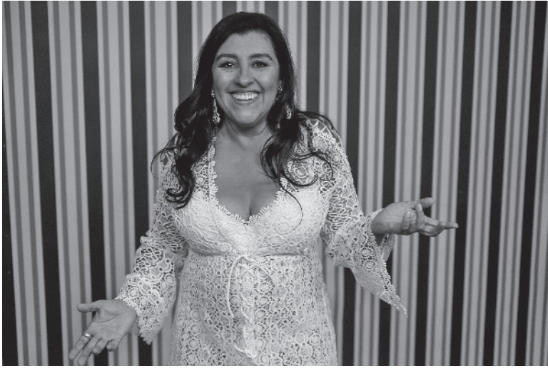
Figure 1.2 Regina Casé.