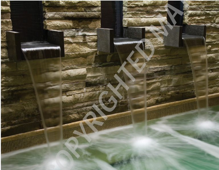
Figure 1.1 Photo courtesy of Allegria Spa. Interior design by Annette Stelmack and Donna Barta- Winfield, Associates III.

There is no greater potential for personal expression than building one's own shelter. For this reason alone, home construction should be sustainable for generations to come. And to be truly sustainable, it is not enough to minimize damage to the environment; the construction must have a net positive impact on it.