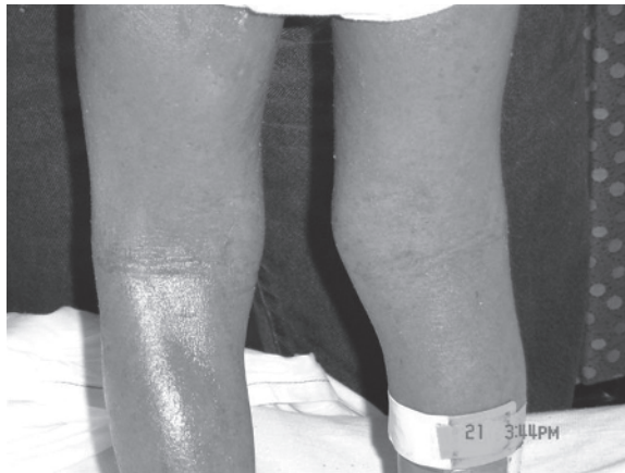
Figure 1.1 A child with multiple food allergies and severe persistent atopic dermatitis (AD) with acute exacerbation due to Staphylococcus aureus superinfection. Note the diffuse erythroderma and open sores. See color plate 1.1.