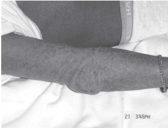
Figure 1.2 AD chronic lesions of skin hypertrophy, lichenification, hyperpigmentation, and xerosis. See color plate 1.2.

Additional material for this chapter can be found online at: www.mountsinaiexpertguides.com This includes a case study, multiple choice questions, advice for patients, and ICD codes