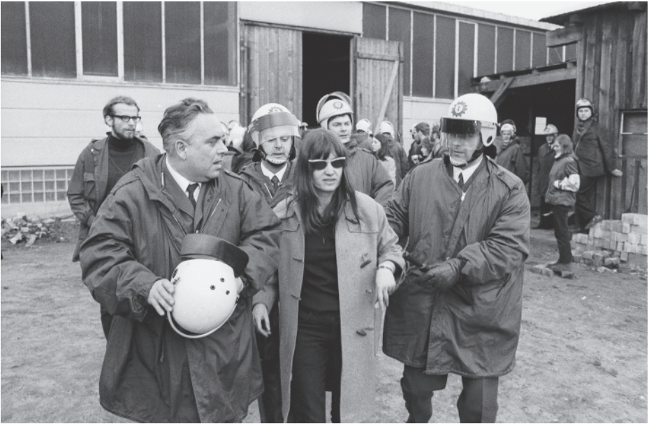
Figure 1.1 Arrest of the journalist Ulrike Meinhof at a protest occupation in the Märkisches Viertel in West Berlin, 1 May 1970 (Klaus Mehner, BerlinPressServices).

evolution of the anti-authoritarian Left in the city (Brown, 2009). While the factory occupation in the Märkisches Viertel was itself short-lived, it was nevertheless the first squatted space in a city where the radical politics of occupation would soon assume a new and enduring significance.