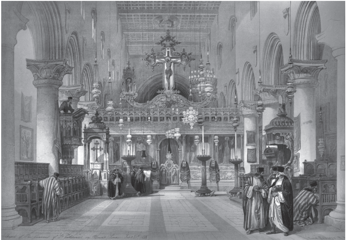
Plate 6 Interior of St. Catherine's Monastery, 19th-century print, the Basilica of the Transfiguration.

over special sites or holy places were often marked by a distinctive architectural shape. Martyria (the tombshrines of martyrs that developed into churches) were often octagonal or rotunda in shape. Octagonal church building in the East also usually designated a particular commemoration of a site: biblical holy places or the like being enclosed in a clear geometric design, with surrounding colonnades to allow pilgrims access to the holy place. The great Church of the Anastasis built by Constantine at Jerusalem combined a rotunda over the site of Christ's death, with a large basilica attached to the holy place by colonnaded porticoes. The design of the buildings in Jerusalem had a powerful effect on the determination of liturgical rites (such as processions or circumambulations) in many other churches of Christendom.