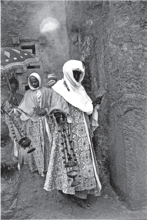
Plate 1 Ethiopian Orthodox clergy celebrating at the rock-carved church of St. George Lalibela.

Roman authorities executed the Scillitan Christians, the proto-martyrs of Africa. Other such persecutions formed the character and psyche of North African Christianity. It became and remained a “persecuted” church in mentality, even after the empire was converted to Christianity.