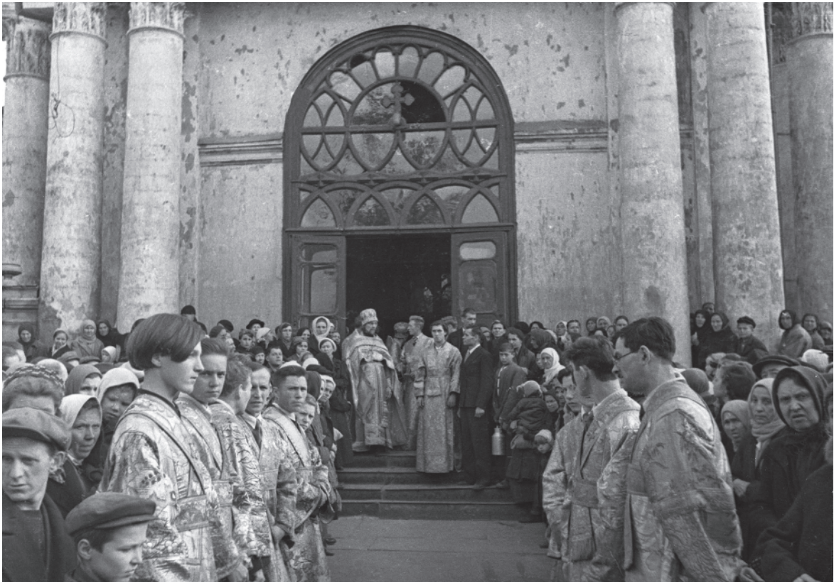
Plate 5 Holy Trinity Church, Sergiev Posad.

Divine Institutes that the Christian church at Nicomedia was a notable public building, and was deliberately burned by imperial troops. Several prestigious churches at Constantinople took their origin from the donation of senatorial villas to church use in the 4th century, a practice which had begun with grants of imperial property and civic basilicas in the time of Constantine (who had commenced this practice to afford some form of reparation of property to the Christians who had suffered confiscation of buildings and goods in the persecutions of the preceding centuries). The Lateran Basilica is one example of such a gift. Other churches were custom-built by Constantine, including the Anastasis (Holy Sepulchre) in Jerusalem, and the shrine of Peter on the Vatican hill at Rome. Both were basilical-style buildings with adjoining martyria.