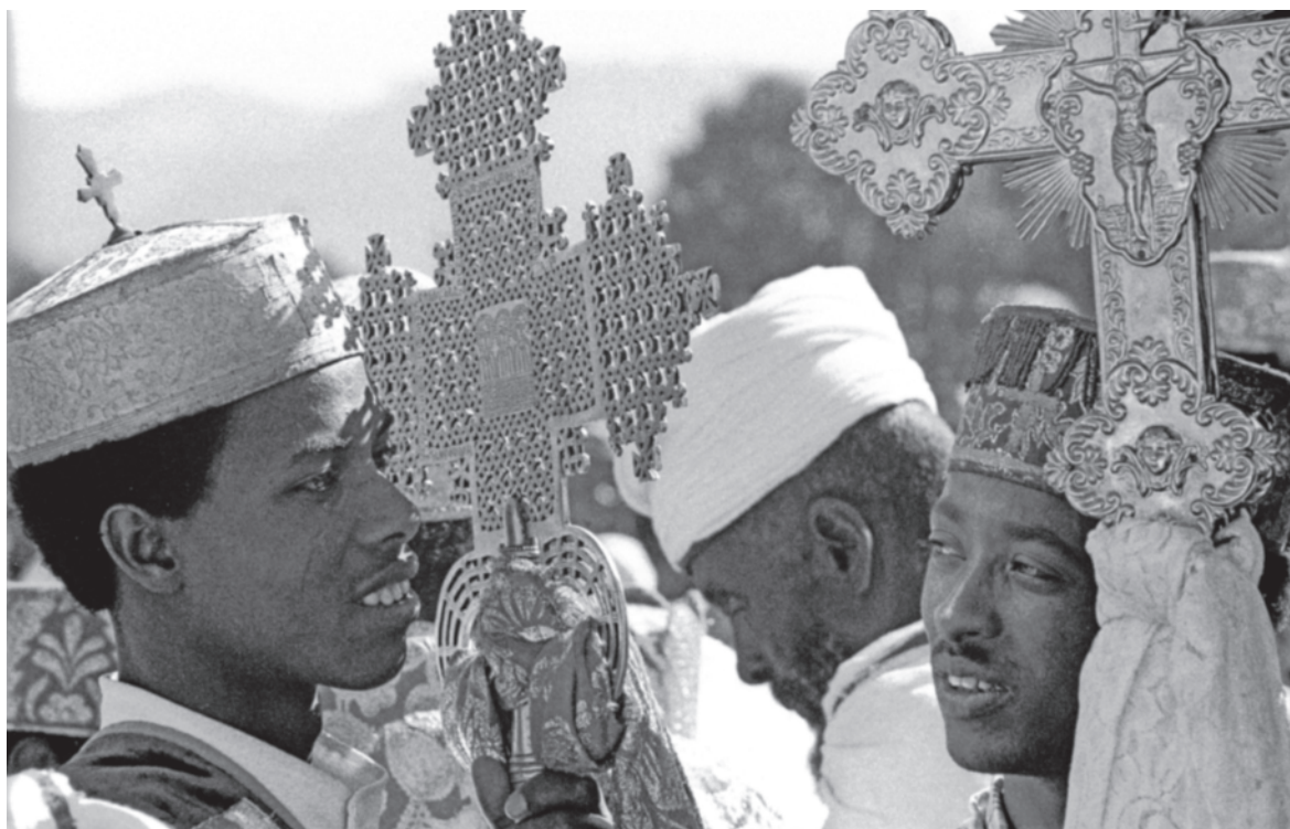
Plate 3 Orthodox clergy at celebrations for the Feast of the Ark of the Covenant (Timkat).

dexterity. Tertullian created many of the most memorable proclamations and formulae of early Christianity, several of which characterize his negative estimation of philosophical “innovators” – “What has Athens to do with Jerusalem?” he asked, casting aspersions on the utility of philosophy in the formulation of church teachings. His heresiological works laid the groundwork for many of the Orthodox responses to the Gnostics, Monarchians, and Marcionites, among others ( The Apology, Against Marcion, Against Praxeas, Against Hermogenes ). Tertullian also provided the Latin Church with much of its technical theological vocabulary (terms such as “person,” “nature,” and “sacrament”).