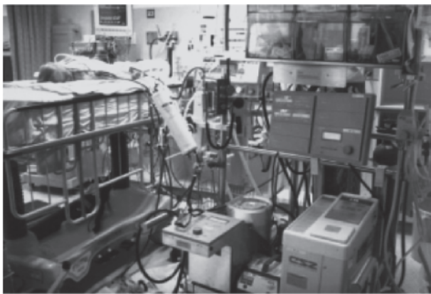
Figure 1.2 Infant on extracorporeal membrane oxygenation in the cardiac intensive care unit.

with CHD who suffer cardiopulmonary collapse post-operatively, who cannot be weaned from CPB, or who need to be supported as a bridge to heart transplantation has proved very effective in reducing mortality rates to astonishingly low levels. In the history of the development of pediatric cardiac anesthesia, we have come a long way from the baby in the ice bath being prepared for DHCA to the complex technology necessary for ECMO resuscitation.