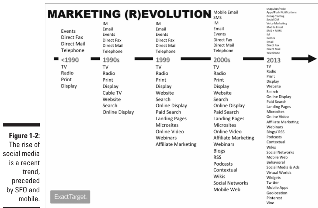
Figure 1-2: The rise of social media is a recent trend, preceded by SEO and mobile.