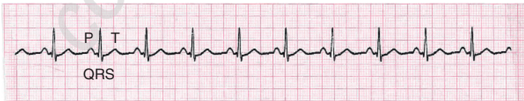
Figure 1.2 PQRST complex.