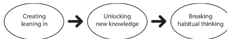
FIGURE 1.1 How the Method Creates Value

So, let's go into a bit more depth on the three types of challenges.