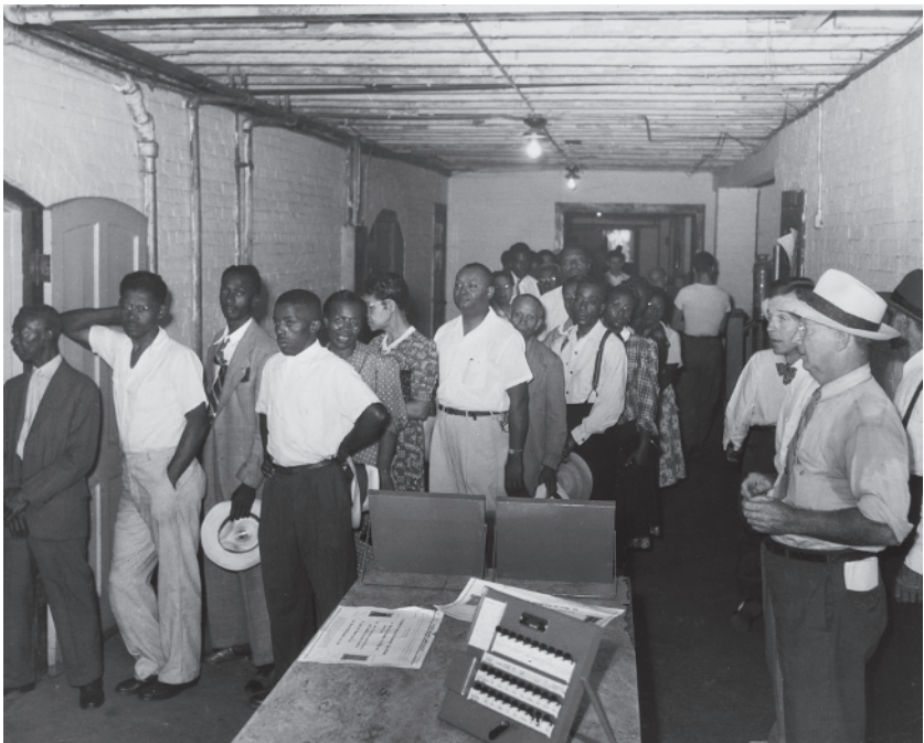
Figure 3 Blacks in Charleston lining up to vote in the 1948 Democratic Party primary.

Just as vital as federal intervention was local assertiveness. Voter registration activities at the grassroots level paralleled the development of the "new Negro," the African American unafraid to stand up for his or her rights in the face of grave danger. The million-plus blacks who registered to vote demonstrated that politics was no longer for whites only. Enrollment drives often brought suffrage reformers into direct confrontation with