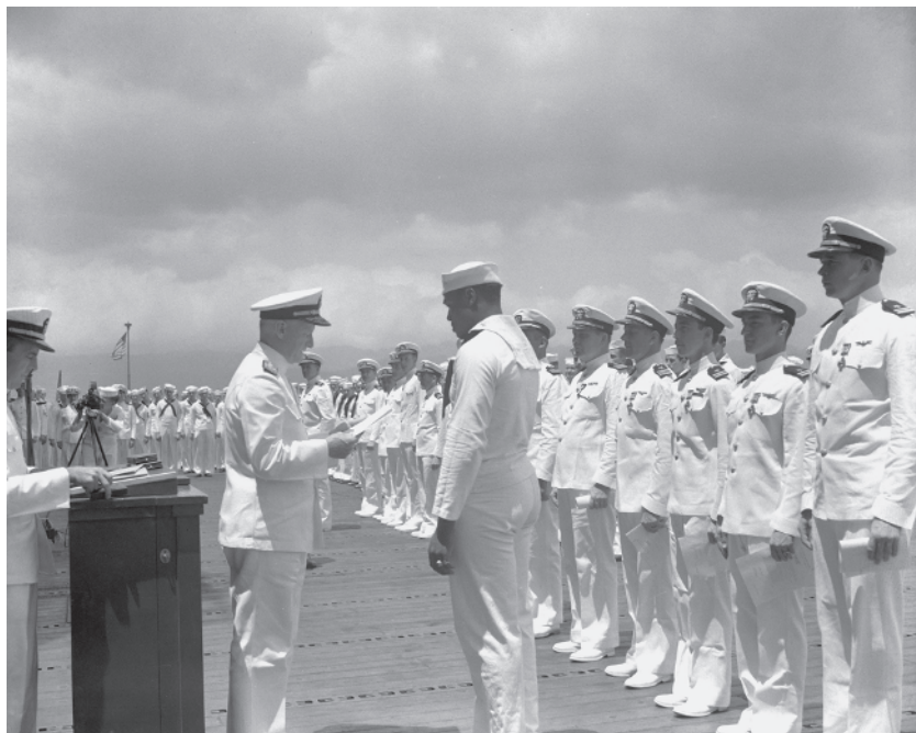
Figure 1 Dorie Miller receiving the Navy Cross from Admiral Chester Nimitz. Miller was later killed in action.

Brotherhood of Sleeping Car Porters and not only fought for economic benefits from employers but also challenged racial discrimination within the trade union movement. In addition, the National Association for the Advancement of Colored People (NAACP), an interracial organization founded in 1909, kept alive the battle for equal rights by lobbying Congress to enact an antilynching bill and petitioning the Supreme Court to outlaw disfranchisement measures such as the white primary.