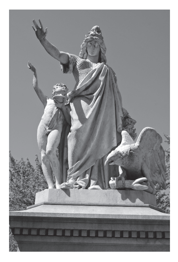
FIGURE 1.2 Moses Jacob Ezekiel, Religious Liberty , 1876. Marble, 25 ft. high. National Museum of American Jewish History, Philadelphia.

classicized Liberty as an 8-foot woman, wearing a coat of mail partly covered by a toga (Figure 1.2). Atop this armor and ancient dress appears a breastplate bearing the shield of the United States. She dons a Phrygian cap, the pilleus libertatis , bestowed on freed slaves, with a border of thirteen golden-colored stars to symbolize the original colonies. She holds a laurel wreath of victory, which also rests on fasces, a bundle of birch rods tied together with a ribbon that function as a symbol of power and unified strength. In turn, the fasces are covered by an open book, meant to signal the US Constitution. Liberty extends her right arm protectively over the idealized, nude young boy at her right, a personification of Faith, who does indeed grasp a flaming lamp as he reaches a hand up to heaven. At Liberty's feet an eagle, representing America, attacks a serpent, signifying Intolerance (and, as I will soon argue, also Temptation), and Faith steps on the serpent's tail. The group stands on a pedestal bearing the inscription "Religious Liberty, Dedicated to the People of the United States by the Order B'nai B'rith and